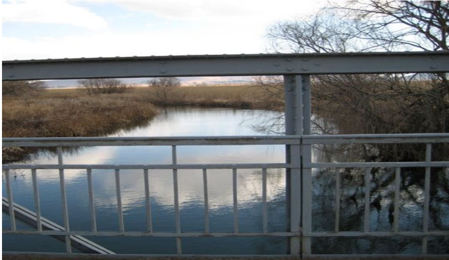
The bridge over the river at Wakkerstroom