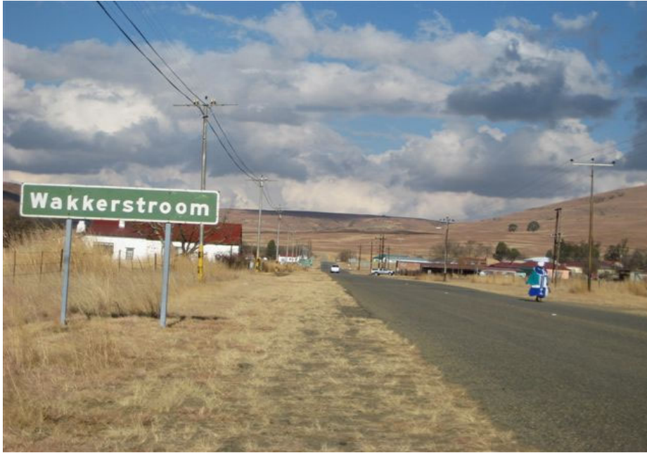
A Zionist in the town returning from worship in 2007