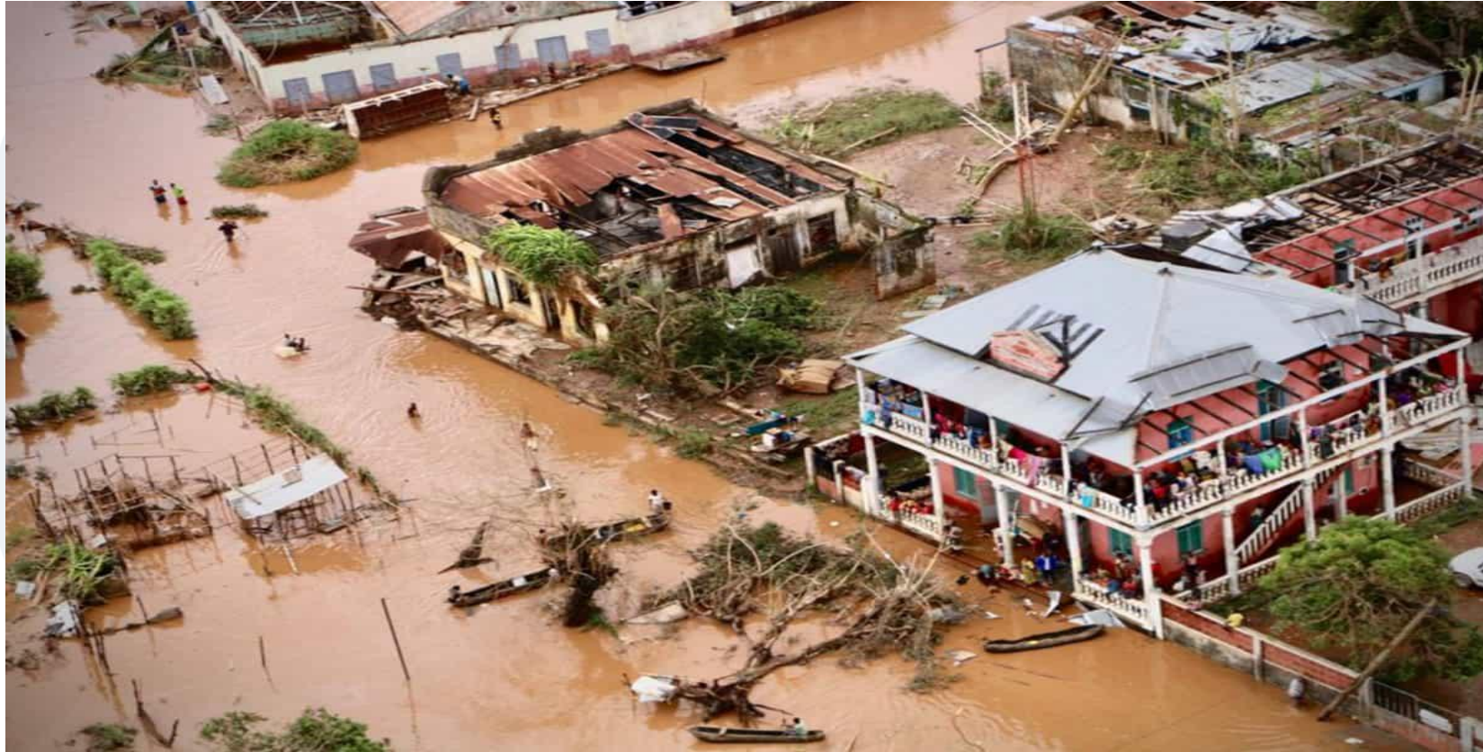
Cyclone Idai (Mozambique)