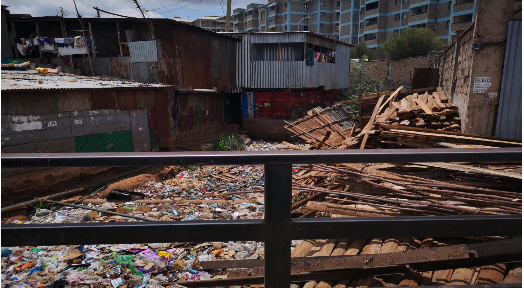
A river passing through Kibera informal settlements (P. Khumalo 2017)