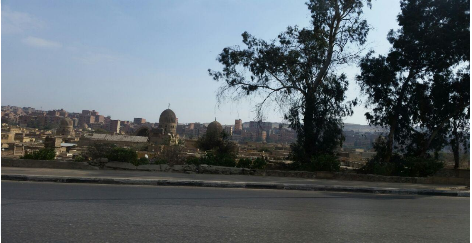
Informal settlements (City of the Dead) in Cairo (P. Khumalo 2017)