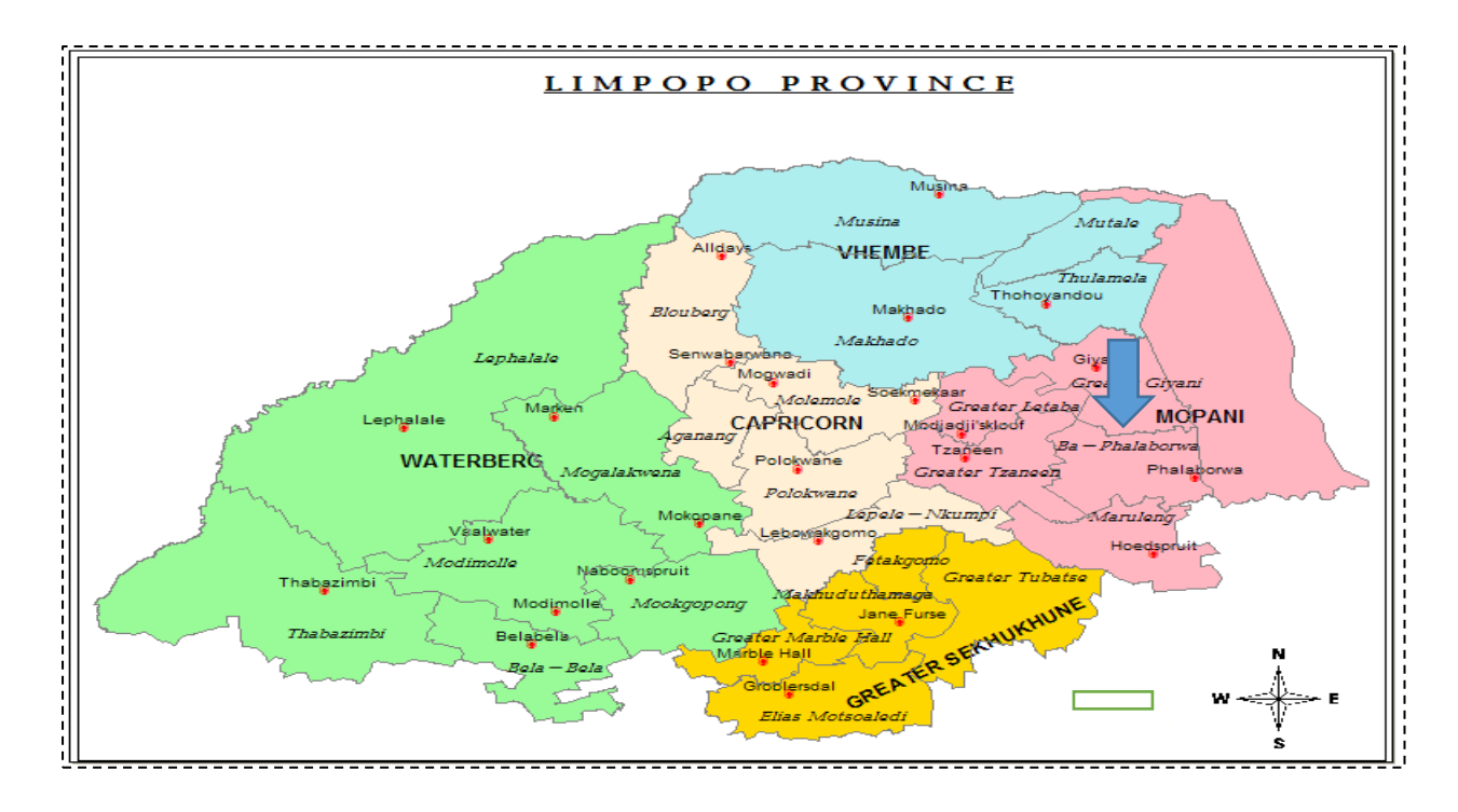
Figure 1.1: Map of Limpopo Province (Statistics South Africa, 2012).

There are five districts in Limpopo province, namely, Capricorn, Mopani, Sekhukhune, Vhembe and Waterberg (Pauw, 2005). The province covers an area of 123 910 km with a population of 5.4 million which has increased from 4.9 million. This study was conducted in six secondary schools of the Lulekani Circuit in Mopani District of Limpopo Province. The Mopani District has 24 circuits and five municipalities, namely, Ba-Phalaborwa, Greater Giyani, Greater Letaba, Greater Tzaneen, Maruleng Municipalities (Mopani District Municipality, 2014). Lulekani is a township situated 14km outside Phalaborwa in Mopani district.