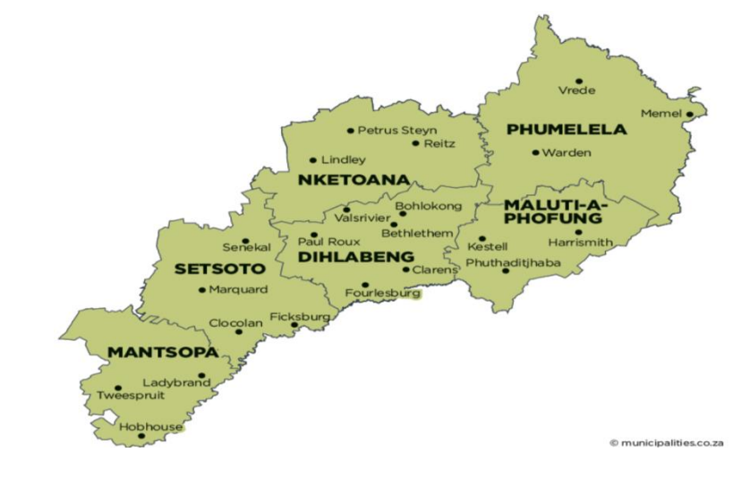
Figure 1: Location of Thabo Mofutsanyana District Municipality within the Free State province.