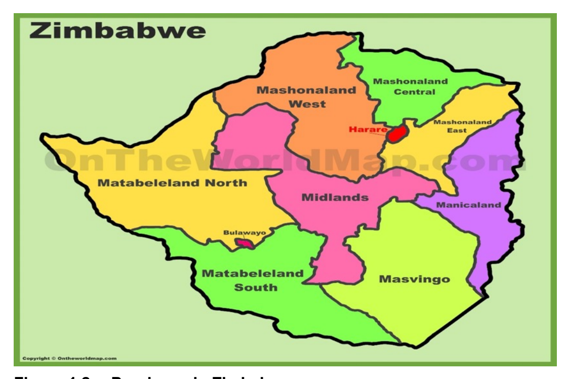
Figure 1.2: Provinces in Zimbabwe