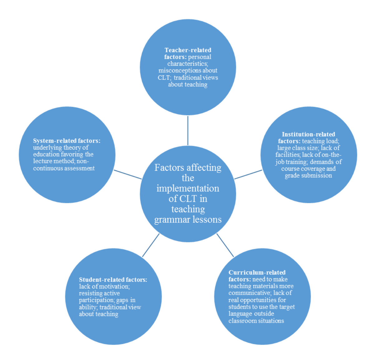
FIGURE 7.3.2: UNDERSTANDING THE MAJOR FACTORS AFFECTING THE IMPLEMENTATION OF CLT IN TEACHING GRAMMAR LESSONS IN AN EFL CONTEXT