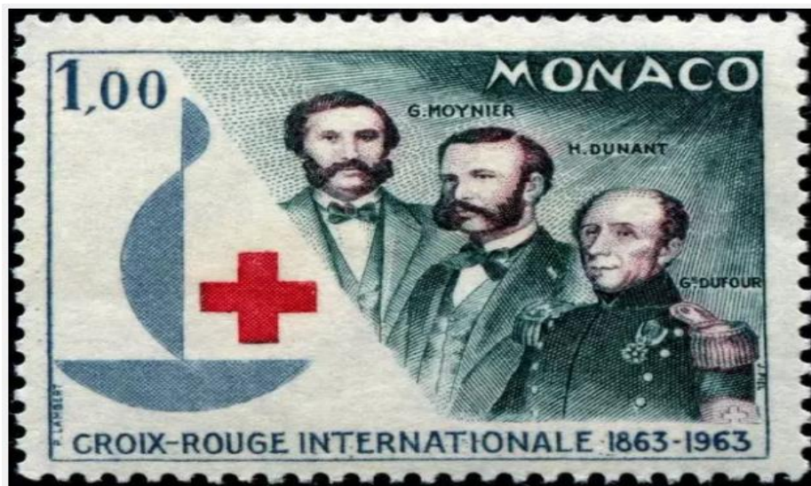
Stamp from Monaco depicting Gustave Moynier (l), Henri Dunant, and General Henri Dufour.

Gustav Moynier, Founder Member of the International Red Cross