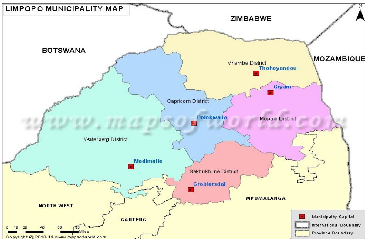
Figure 1.1 (below) illustrates the map of Limpopo Province one of the nine provinces of South Africa in which the study was conducted.

According to the DoE (2001:8) WP6 in the mainstream schools, education priorities should include multi-level classroom instructions so that teachers can prepare main lessons with variations that are responsive to individual learner needs, co-operative learning, curriculum enrichment, and enable dealing with learners with behavioural problems. This means that teachers need skills and knowledge of how to develop such variation of lessons in order to accommodate the diverse needs of all learners. Landsberg, Kruger and Swart (2011:88) declare that identification of the resources and assets in the child's environment that can provide a basis for learning opportunities and participation is important in early childhood education. Therefore it is important to explore the practices of inclusive education in the Grade R classes since this is where the formal learning of the child begins. In the researcher's opinion Grade R teachers currently lack specific skills and knowledge in order to practice IE in Limpopo, particularly in Nylstroom circuit.