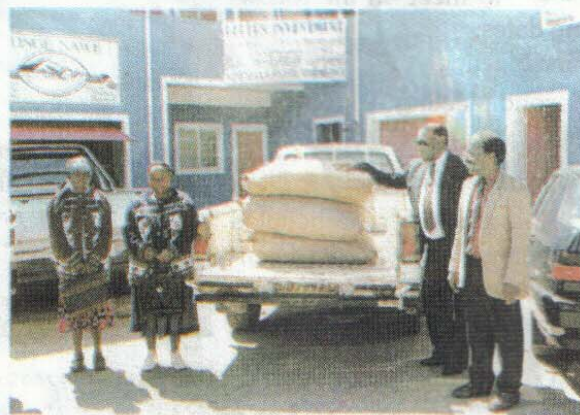
Second Donation for Drought Relief Through National task Force