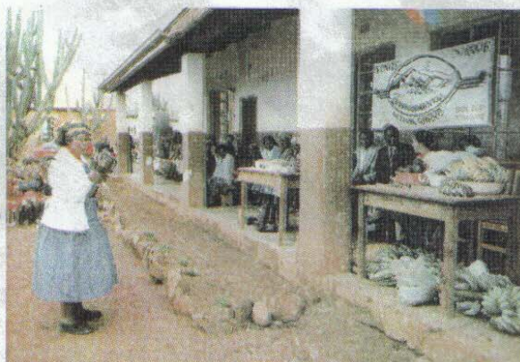
Produce from one of their projects