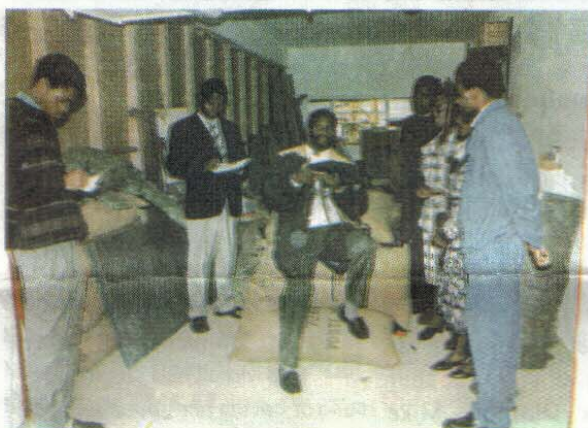
Donation by the group in 1996 for drought relief through Red Cross