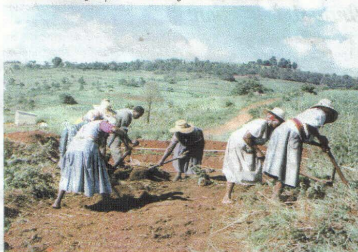
Women from Nsinqweni "doing their bit!"