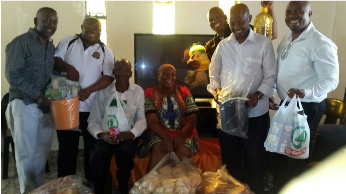
Figure 4.1 Christian Men Ministry hand over groceries to needy church workers.