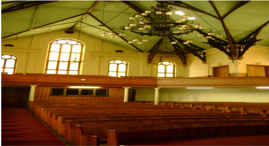
Figure 2.2 Melodi ya Tshwane church interior.