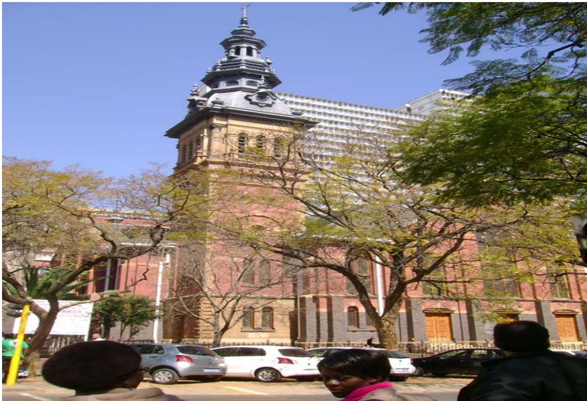
Figure 2.1 Melodi ya Tshwane church building.

The building is one of the finest Dutch Reformed church buildings in the country. It is the first church in Pretoria built in the style of the state. Figures 2.1 are photographs of the exterior and interior of the MyT church building.