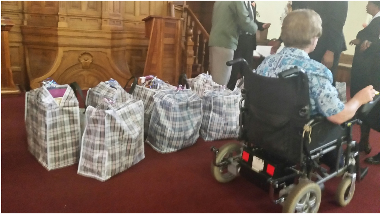
Figure 4.4 The disabled receive groceries from Ward 9.