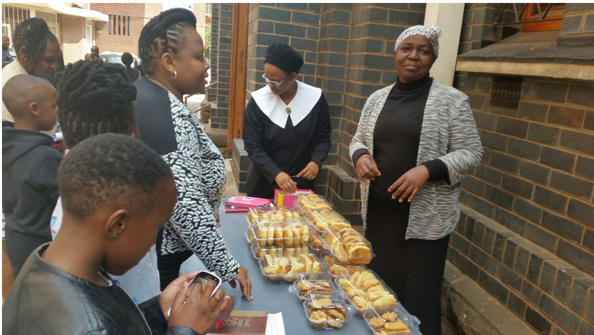
Figure 4.5 Ward 9 fundraising by selling scones at MyT.