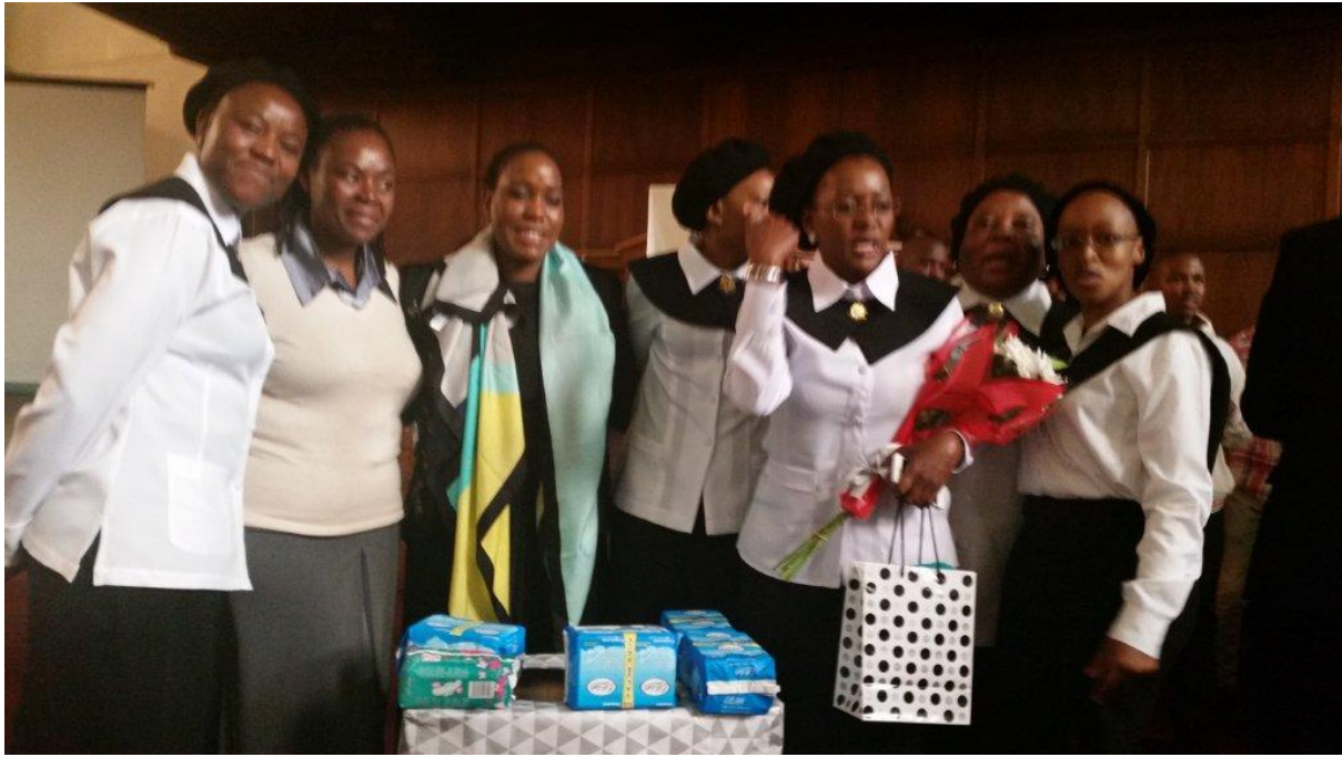
Figure 4.2 Collection of supplies of sanitary towels by Christian Women Ministry.