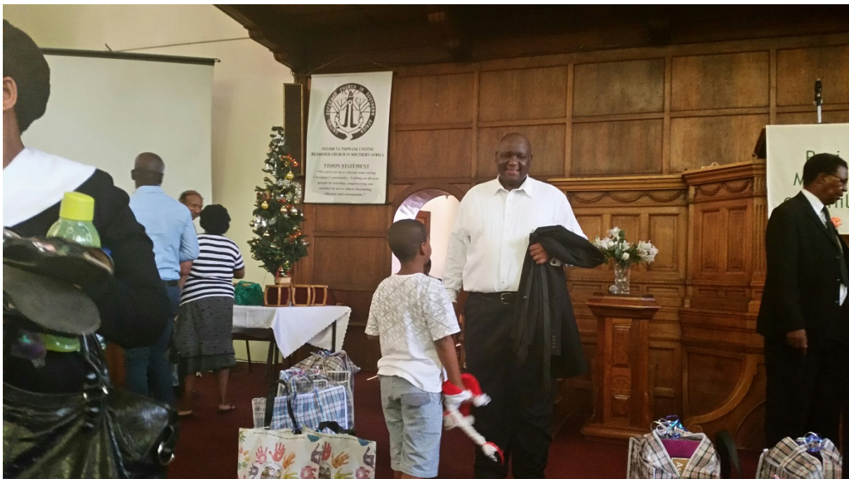
Figure 4.3 Ward 9 hands over groceries to pensioners.