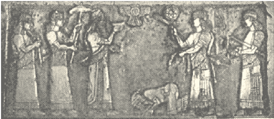
b. This panel of the black obelisk of Shalmaneser III shows and in cuneiform mentions, "Jehu the son of Omri".