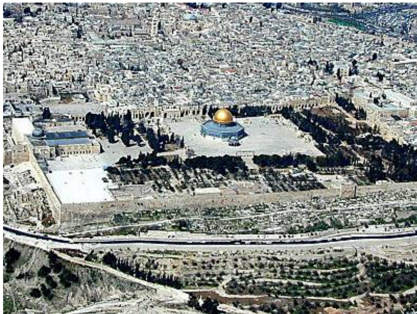
b. Temple Mount in Jerusalem

a. High Place of Jeroboam: Nearly all archaeologists agree that this excavated podium was the one that Jeroboam constructed to house the golden calf at Dan. Archaeologists now think the platform was roofed. Evidence of a four-horned altar has been found as well as religious objects such as three iron shovels, a small horned altar, and an iron incense holder.