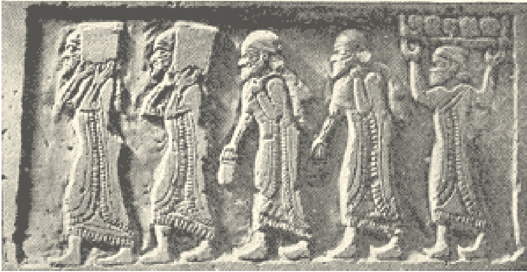
a. This panel of the Black Obelisk of Shalmaneser III shows Jewish captives bringing tribute to the King.