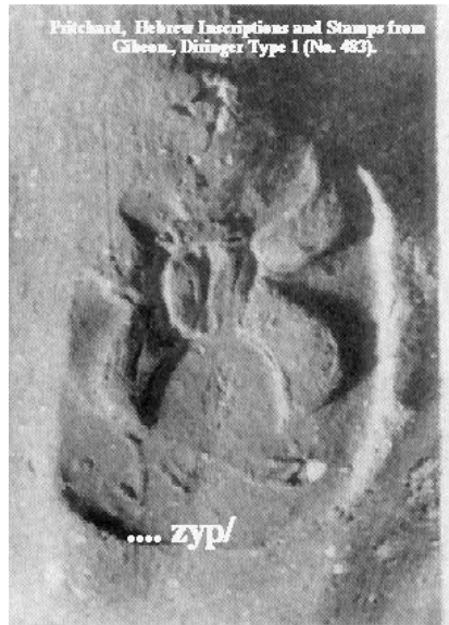
Inscription showing the name ZIP from Gibeon