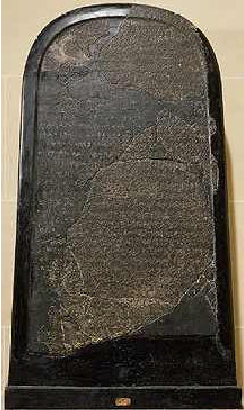
Fig. 4.5-3 Moabite Stone Stele of Mesha