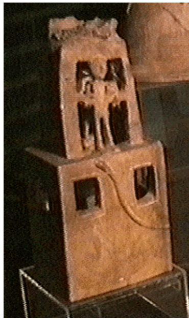
c. Iron I Shrine House Beth-Shan (Stratum V)