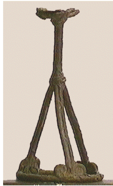
d. Incense Burner