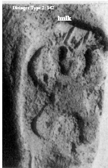
Royal Stamp Seal from Gibeon showing Imlk Iron II