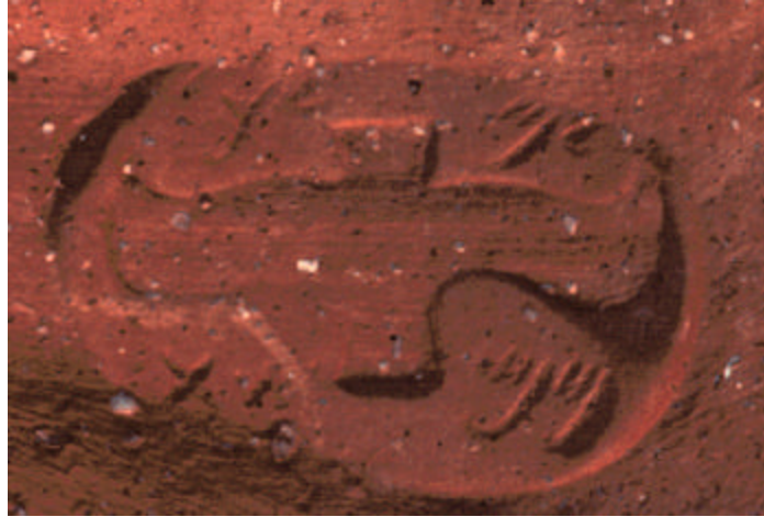
a. Royal stamp Seal Type 3 at Gibeon