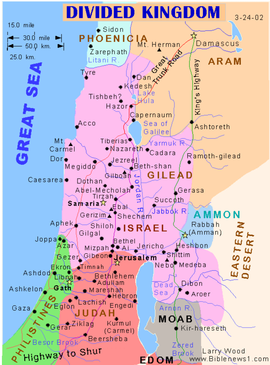
Figure 2.2-2 Kingdoms of Israel and Judah