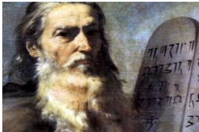
Moses and the Decalogue

Keywords: Moses, Exodus, Egypt, Promised Land, strategy, management