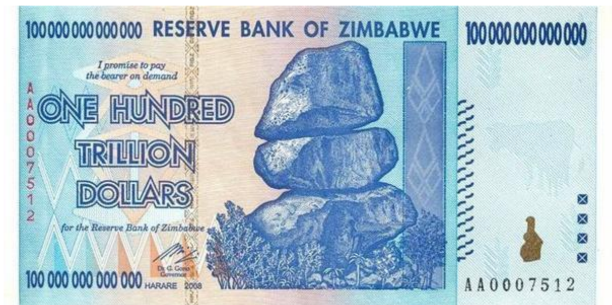
Fig 1A one hundred trillion bearer cheque

What followed were a series of events that plunged the nation into deep poverty, for example, severe macroeconomic instability resulted in continuous economic decline, characterised by hyperinflation, chronic shortages of basic commodities and a decline in essential social facilities. Zimbabwe's economic situation was further worsened by political and economic isolation which further plunged the nation into unprecedented economic conditions characterised by an inflation rate of 100,000% by January 2008. (AVERT 2011:4). At that time, the economy had a one hundred trillion dollar note circulating which was worth buying only bread and a packet of sugar (see Figure 1 below). This further exacerbated the plight of OVCs as the macro economic developments had clear repercussions for their welfare. For example, there were increased cases of child malnutrition due to shortage of food. The NGOs' food distributing programmes were stifled by government under the NGOs Bill due to political reasons. Below is a picture of a one hundred trillion bearer cheque which was circulated around 2008, demonstrating the hyperinflationary environment and the desperate situation Zimbabwe was in.