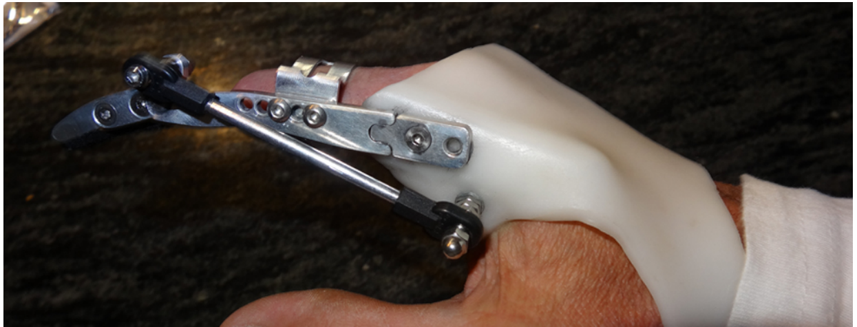
A proud kid gets his robohand in the house4hack workshop