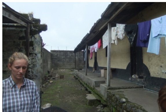
Photograph 8: A view of the female yard, PA (FP)

The lack of recreational facilities in prisons is not limited to Cameroon but is also found in Egypt where the women in Tanta women’s prison lacked organised sports or exercise programmes (MEW 1993). The lack of recreational facilities is blamed specifically on the issue of space as the prisons were originally designed for men. Photograph 8 below depicts the female wing at PA and shows that there is no space in which any meaningful recreational programmes may take place.