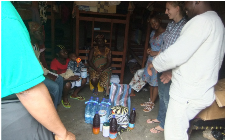
Photograph 4: A view of the female cell at PA during a visit of a CSO (FP).

“Every prisoner shall be provided with a separate bed, and with separate sufficient bedding which shall be clean when issued, kept in good order and changed often enough to ensure its cleanliness” (Article 19, UN SMR). However, this rule is often not respected in African prisons, including prisons in Cameroon. According to LHR (2006), in many South African prisons, there are also no beds provided for the prisoners. The prisoners are provided with two mats, sponge cushions, three blankets and, usually, no sheets. While this provision of bedding may seem inadequate to a South African prisoner, the prisoners in Cameroon are not as privileged as their South African counterparts (see remainder of this subsection).