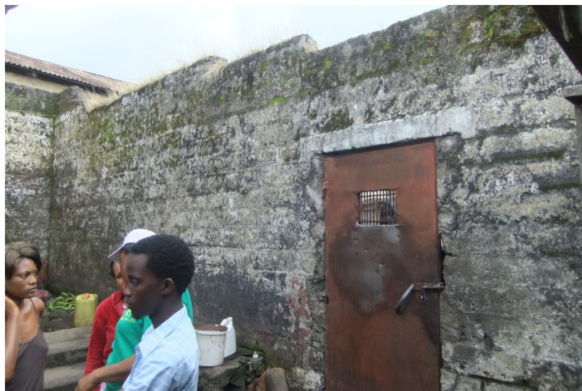
Photograph 6: The wall and gate separating the female from the male inmates (FP)

PA has a more secure gate for separating the female inmates from the male inmates than do PB and PD. This, however, does not prevent female and male inmates from communicating through the small grid in the door. Photograph 6 depicts how a male prisoner may look through the grid window in the iron door while there are visitors in the female cell. (This will be discussed further in Chapter 7).