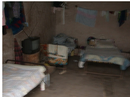
Photograph 3:Colonial iron beds in the cell of female inmates at PA 2010 (FP)

However, by the time I visited the same prison in February 2012, the beds had been replaced. An NGO had donated new beds and the female inmates were sleeping on the bunk beds, as depicted in Photograph 4 below. The iron beds in Photograph 3 had all been damaged and the female inmates had conveyed how they had used ropes to tie the beds together so that they could sleep on them without falling. With the provision of the bunk beds they will now be able to save some money as they will no longer have to buy ropes to tie the beds and they will be able to use the money to rent mattresses. In view of the fact that the bunk beds were provided without mattresses, the female inmates rent (borrow) mattresses for FCFA 750 per month. However, this renting of mattresses is not a general rule in all prisons because there are some prisons (e.g. PB) where the inmates have excess mattresses. In addition there is a television in the cells for the inmates although cellular phones are not permitted.