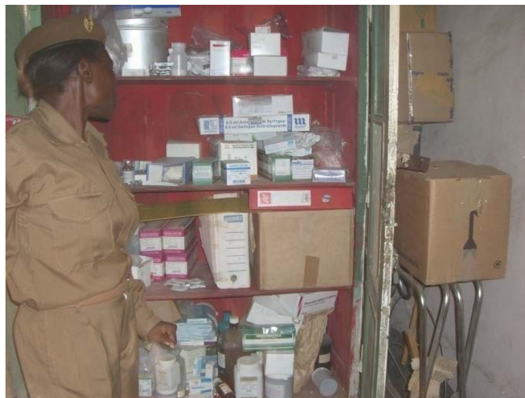
Photograph10: Drugs stored in the cupboard of the prison Infirmary PA(FP March 2011)

They do buy drugs according to the pathologies...most of the illnesses that are frequent within the prison, like malaria, gastro enteritis; gastric...TB drugs are given free by the delegation of health. For the antiretroviral drugs, when we have a case here, it is being taken up by the district hospital. We go with their books, they supply the medicine through me and I will just keep on giving to them. If you enter that cupboard you will see that we have anti epilepsy, hypertensive, asthmatic drugs, injections, not just paracetamol as the inmates tell you (Prison nurse PA).