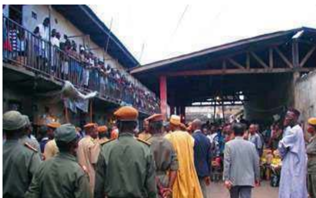
Photograph 9: The courtyard of Kondengui Prison in Yaounde (Tande 2012)

The photograph above portrays life in prison with the inmates in front of their cell, looking at the prison staff below in the yard and visitors waiting to see some of them.