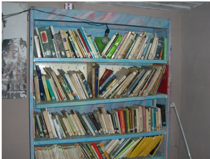
Photograph7: Library PA (FP July 2009)

impression that women do not like reading and reinforcing preconceived assumptions about women and gender construction.