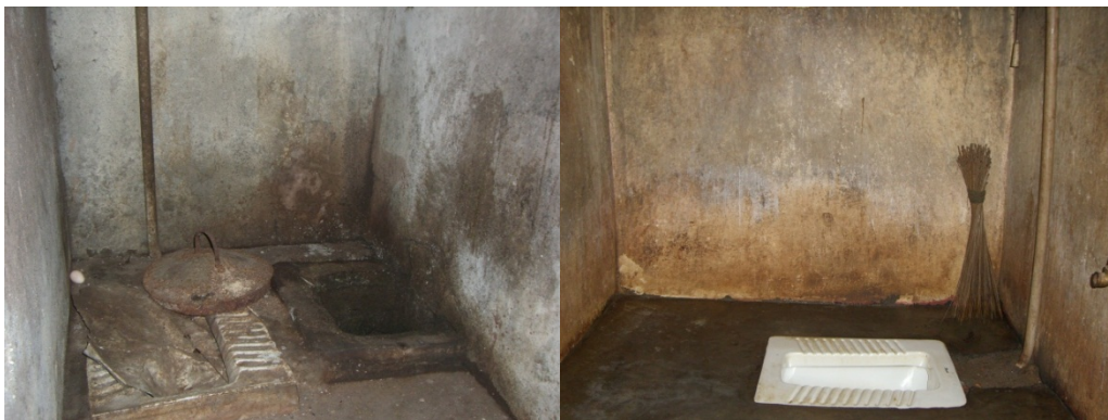
Photograph 5: Old dilapidated, colonial toilet facility for female inmates at PA(Left) and the semi modern toilet a PB (Right) (FP)

PA was the first prison to be constructed in English speaking Cameroon in 1930 and the structures have not been renovated to any extent over the years. Although the toilets for male prisoners have been adapted to flush toilets, thus eliminating the use of buckets, the septic tanks are not properly maintained and the result is leaking faeces. The female inmates' toilet has not changed since it was constructed in the colonial days and is a 'pit toilet' (see Photograph 5). The research participants indicated that they did not use it and, instead, they used small buckets and then transferred the waste into the toilet. A strong stench from the toilet was pervading the air.