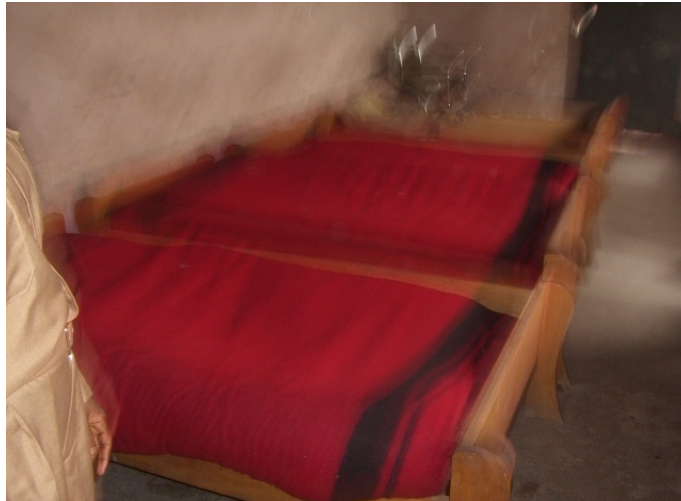
Photograph11: Beds in the outpatient ward in the prison infirmary (FPMarch 2011)

The subsection on menstruation below discusses another facet of healthcare. The non provision of sanitary towels to female inmates may jeopardise their sanitary and health needs.