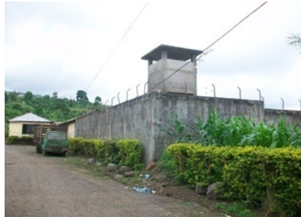
Photograph 2 : Entrance to Prison A and a view of the watch towers, truck and maize (Fieldwork photograph [FP])

The iron beds on which the prisoners in PA slept in 2010 were the same beds that were used by the first occupants of the prison 80 years ago.