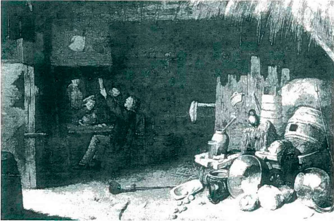
1 David III Ryckaert, Drinking Peasants in a Barn Interior . Signed and dated D.RYC.F. 1638. Panel, 50,5 x 80,5 cm. Dresden, Staatliche Kunstsammlungen, inv.no. 1092.