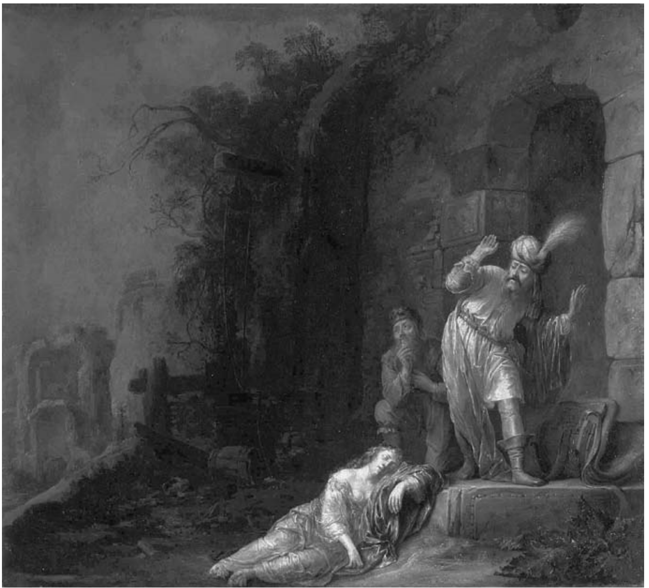
6 Willem Bartsius, Death of the Levite's Concubine , signed and dated 1638, oil on canvas, 100,5 x 110 cm. St Petersburg, The State Hermitage Museum, inv. no. GE-3384.

on all the figures' hands, the Levite's feathered turban and the naturalistic rendering of folded drapery and other kinds of material. As in Abraham Pleading with Sarah on Behalf of Hagar (fig. 2), the scene takes place in front of the door of a house overgrown with dense foliage, but here the painting extends on the left to reveal a view of buildings in ruin. 76