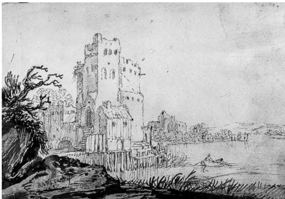
1 Willem Bartsius, River Landscape with Castle , signed and dated: BARTIVS f. / 1657, pen and brush in brown, traces of pencil, 13 x 18,8 cm. Cologne, Wallraf-Richartz-Museum, inv. no. 1964/13.

After 1639, there is no trace of Willem Bartsius in any document, not even a mention of his death. The Cologne drawing of a River Landscape with Castle , signed and