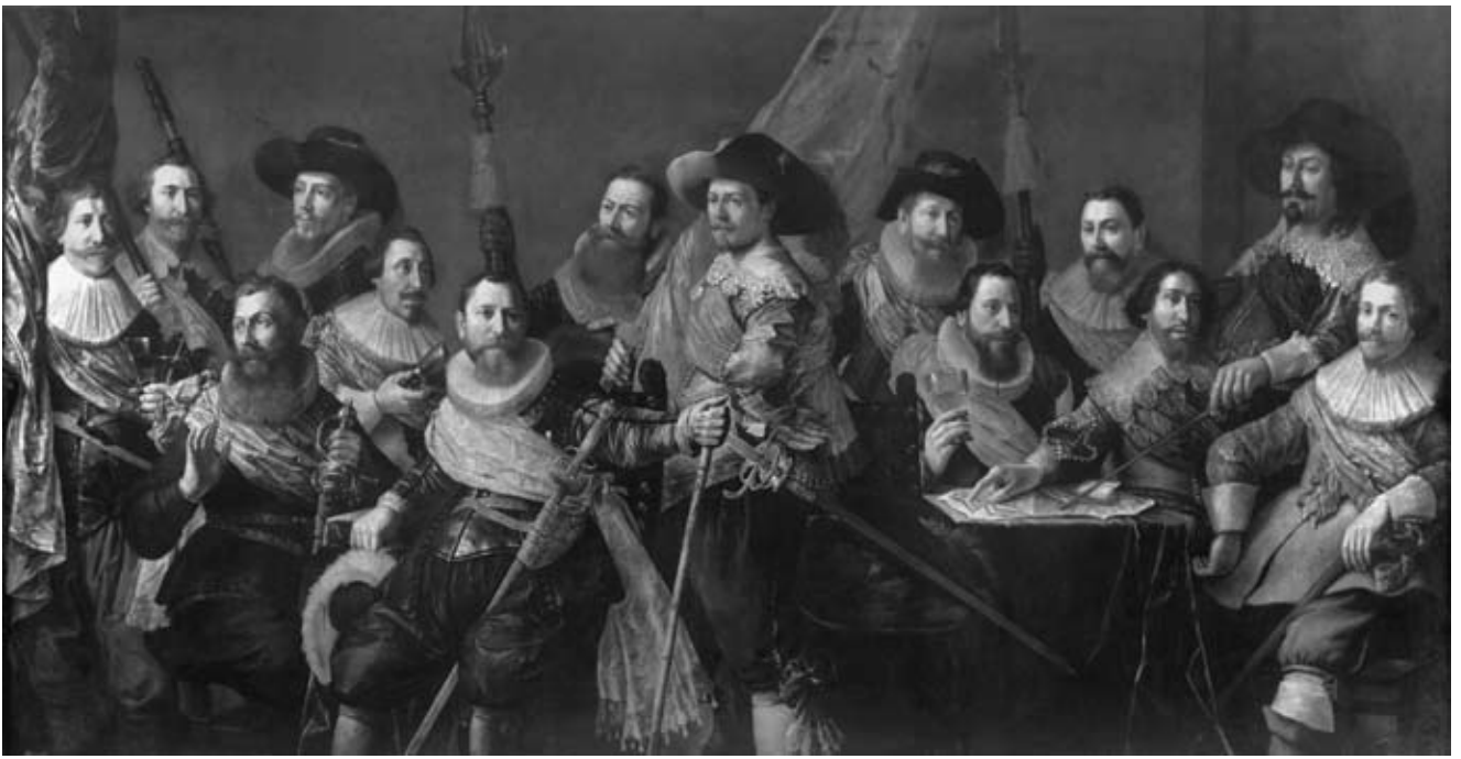
18 Willem Bartsius, Officers and Standard Bearers of the Oude Schutterij of Alkmaar , dated middle right on map: A° 1634, oil on canvas, 198,2 x 385,7 cm. Alkmaar, Stedelijk Museum, inv. no. 20726.

characterisation and attention to detail, several figures are awkwardly proportioned and their heads do not seem to fit comfortably on their bodies. The least successful figure is the man seated to the left of the flag bearer. His head is too large, he has no left shoulder, his left arm is unnaturally twisted and his chest is severely flattened. Despite these compositional and proportional failures, much attention has been spent on meticulous details of clothing and accessories. All the men in the portrait have beards and moustaches and are decked out in their finest black or light brown clothes with red or blue sashes and various types of white collars. 124 Some wear armour and display their sword or hold a wineglass in an elegantly poised hand. Clearly, Bartsius proved himself once again as a master in facial characterisation and textural variation, but only in small individual sections. The fact that he was not particularly successful in putting the pieces together, may be attributed to lack of experience in painting complex compositions or, if he relied on the assistance of his pupil Abraham Meyndertsz, to a lack of co-ordination. Nevertheless his clients were pleased considering the fact that Bartsius received f 225- for the painting and f 90- for the ebony frame which is still in place. 125