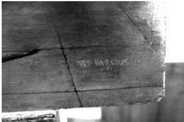
5 Willem Bartsius, Samson and Delilah . Detail of fig. 4 showing the signature.

The main protagonists – Delilah, Samson, the old man cutting Samson’s hair, along with the little boy – are caught in a strong beam of light. This strengthens the theatrical atmosphere created by Delilah who looks at the viewer and raises a finger to call attention to the scene enacted. To maintain this focus, the surrounding shaded areas lack definition with the furthest background figures executed in rudimentary shapes and generally dark tones. The main figures, their costumes as well as the objects of still life are characterised by what Sumowski termed elegant fijnschilderkunst and exquisite colouring. It is not difficult to see why Sumowski considered the painting of Samson and Delilah to be Bartsius’s masterpiece. 61