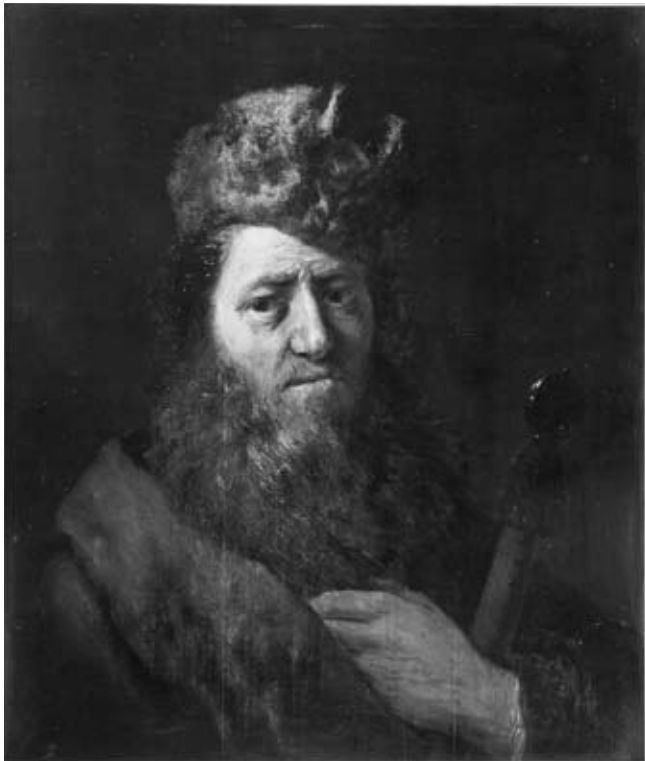
10 Willem Bartsius, St Paul , signed top right: BARTIV F., oil on panel, 69,5 x 59,5 cm. Utrecht, Rijksmuseum Het Catharijneconvent, inv. StCC s 35.

Resembling the format of a portrait but belonging to the field of history painting are the busts of St Paul 91 (fig. 10) and St Peter (fig. 11). 92 St Paul who has a long beard