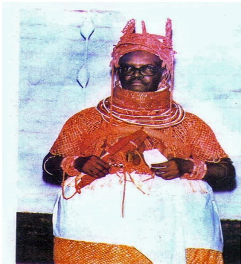
Figure .2. Oba Erediauwa of Benin (1923-) in his traditional bead regalia.

The Otue Ugie-Erhoba precedes the other royal Ugie ceremonies. The chiefs accompanied by their individual dance groups dance to the palace to pay homage to “ Umogun ” (the Oba, who dresses in his full traditional regalia of beads) and pray for his longevity on the throne. This event is usually a spectacle to behold as chiefs in their complete ceremonial robes (white robes from the waist down with bare chests, and beads around the neck and hands), according to the hierarchy in the palace, display their artistic prowess to the admiration of all.