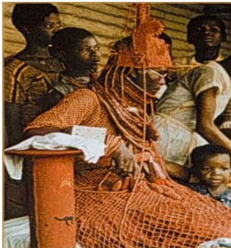
Figure.3. Oba Akenzua II of Benin (1899-1978) in his traditional bead regalia

However, the Otue Ugie – Erhoba commences with the appearance of the Omo N' Oba from the palace chambers. Before the emergence of the Oba , the various categories of chiefs, guilds, and functionaries at the ceremony are expected to arrive at the palace to commence the whole process of the Otue Ugie – Erhoba .