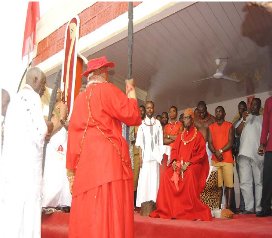
Figure .5. Chief paying homage to Oba of Benin during Igue Oba festival

Before the commencement of the ceremony, all eligible chiefs dance with their followers from their homes to the palace. Each of them dresses in the ceremonial regalia which the Oba granted him to wear on the day of the confirmation of his chief's title.