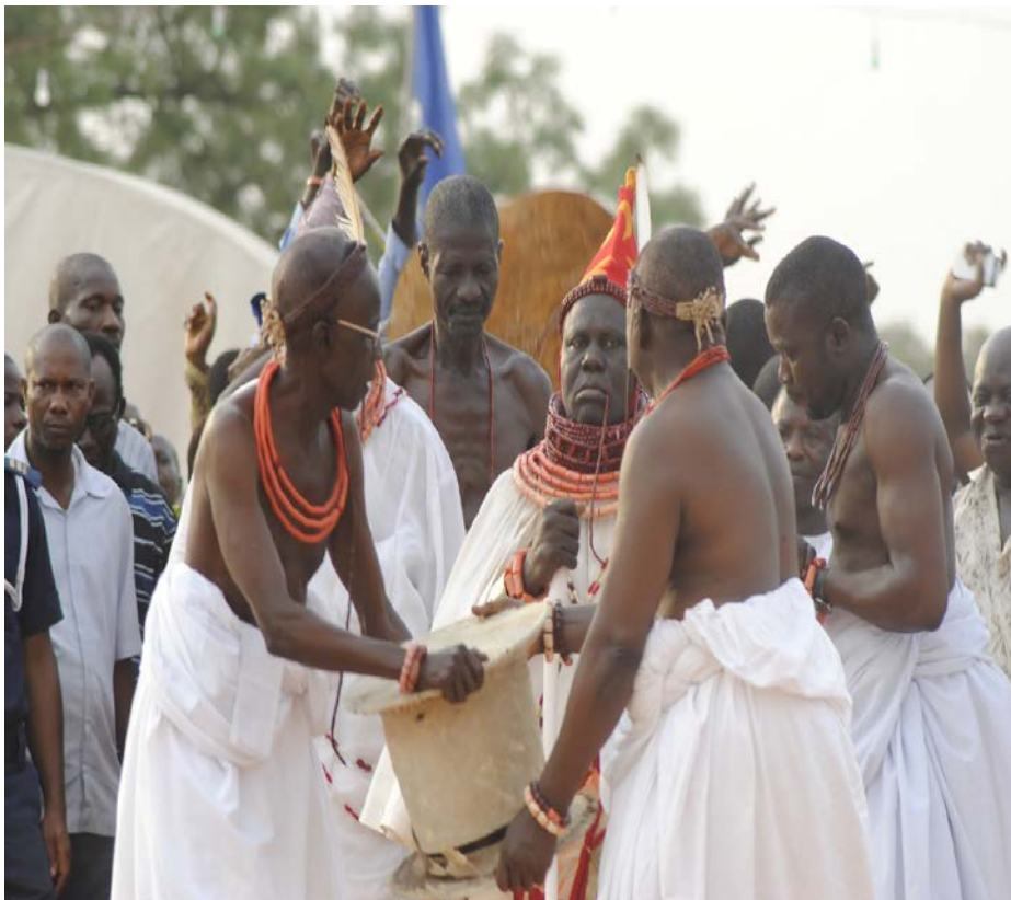
Figure.6. Chiefs performing during Igue festival

Emma-Edo , consisting of small drums, Egogo (gongs) and Ukuse (maracas). These are musical instruments that are played to give an original perception of royal music during the ceremony and merriment. Instrumentalists accompany the chiefs with songs in a dance procession to the palace to perform at the festival. The dominant dance is the Ugie dance, which is performed by all the chiefs including the Iyase , leader of the Eghaevbo N' Ore and head of all the palace chiefs.