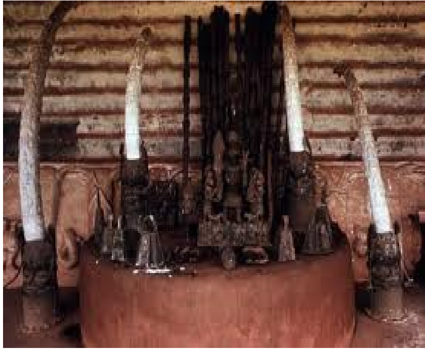
Figure .4. Ancestral altar

The main rites of Ugie—Erhoba commence with a prayer which the Omo N' Oba personally says. He holds the offered animal as he says the prayer. As a follow-up, the Omo N' Oba personally performs another sacrifice at the shrine of Aroto (mother earth) to appease the earth deity. At the shrine, the Oba prays with a bowl of kola-nuts, after which the Isekhure also takes his turn to pray with the bowl of kola-nuts. After the prayers, tradition requires that the Isekhure pick one nut from the bowl and break it. From this broken nut, the Omo N' Oba then picks one piece and places it on the ground. Following this act the offered animal for this rite is slaughtered by the Omo N' Oba ; Ahe (goat) is used for this rite. With this rite concluded, the Omo N' Oba returns to sit on the throne and await the chiefs' homage and dances.