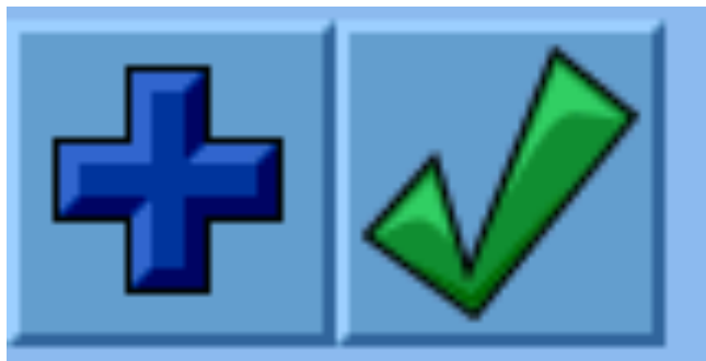
Figure 1 Buttons for selecting and adding objects

We saw evidence of this in both the educational games, where there were clear usability problems. For example, in Timez Attack, a congratulatory message incorrectly appears on the screen before the player had actually achieved any milestone in the game. All the children ignored the message. The adults were taken aback or questioned why they were being congratulated before completing a task. In Storybook Weaver the buttons for selecting and adding objects to a story page do not follow general interface conventions. Children, however, were unperturbed when they had to select and add an object by clicking on the + button instead of the expected ✓ button, as shown in Figure 1 below.