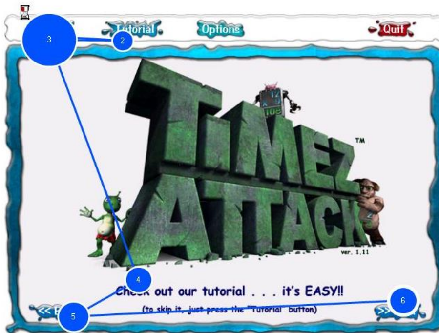
Figure 2 Fixations of a child novice on the opening screen

Children displayed fearlessness when confronted with a new application. They just wanted to get on with it, while most adults first consulted the instructions or tutorials. Eye tracking results revealed that when the application was a game, children immediately searched for the button that would activate the game. In Timez Attack, for example, the longest fixations of child novices were on the Play button at top left on the screen (see Figure 2). Adult participants, by contrast, fixated on the instructions at the bottom of the screen. This particular adult did not look at the Play top left button at all, as shown in Figure 3.