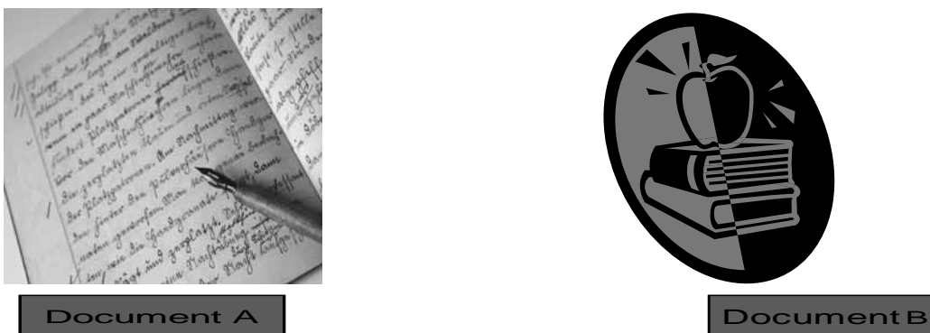
Fig 1: Relationship between a reference and citation

The terms 'reference' and 'citation' are commonly used interchangeably. There is, however, a difference between the two terms. Smith (1981:83) defines a citation as an " acknowledgement that one document receives from another ", while a reference is the " acknowledgement that one document gives to another ". The difference therefore lies in the words 'receives' and 'gives', which introduce other terms such as cited and citing documents. Diodato (1994:136) explains that a reference is a " publication mentioned in a document, usually in the document's footnotes, endnotes, bibliography or list of references " and describes a citation thus: " When document A is mentioned in document B, the mention is a citation for document A ". Simply put, one document's reference is another's citation. In order to clearly appreciate the difference between the two terms, Diodato's (1984:32) explanation is graphically illustrated in Fig 1.