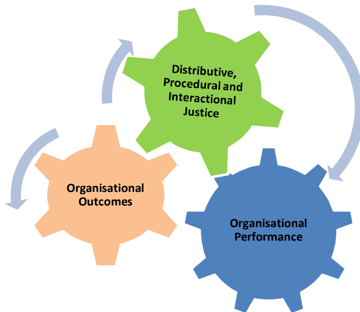
Figure 2. The relationship between organisational justice and organisational performance. Adapted from 'Exploring the association between fairness and organisational outcomes in supply chain relationships,' by Hornibrook, S., Fearn, A. and Lazzarini, M, 2009, International Journal of Retail and Distribution Management , 37, p. 793.

Aldrich and Ruef (2006) purport that even if organisations follow general societal norms, they must also confront a problem that occurs in any situation where benefits or burdens are distributed i.e., do members perceive the system as just, in a distributive and procedural sense. In a study on the perception of politics and fairness in the merit of pay, Salimaki and Jamsen (2010) found that perceptions of politics and fairness distinctively and interactively predicted whether the pay system was perceived effective in achieving its objectives. Their findings suggest that some form of politics or perceptions of unfairness in performance management might actually render the system ineffective, and therefore unable to meet its objectives.