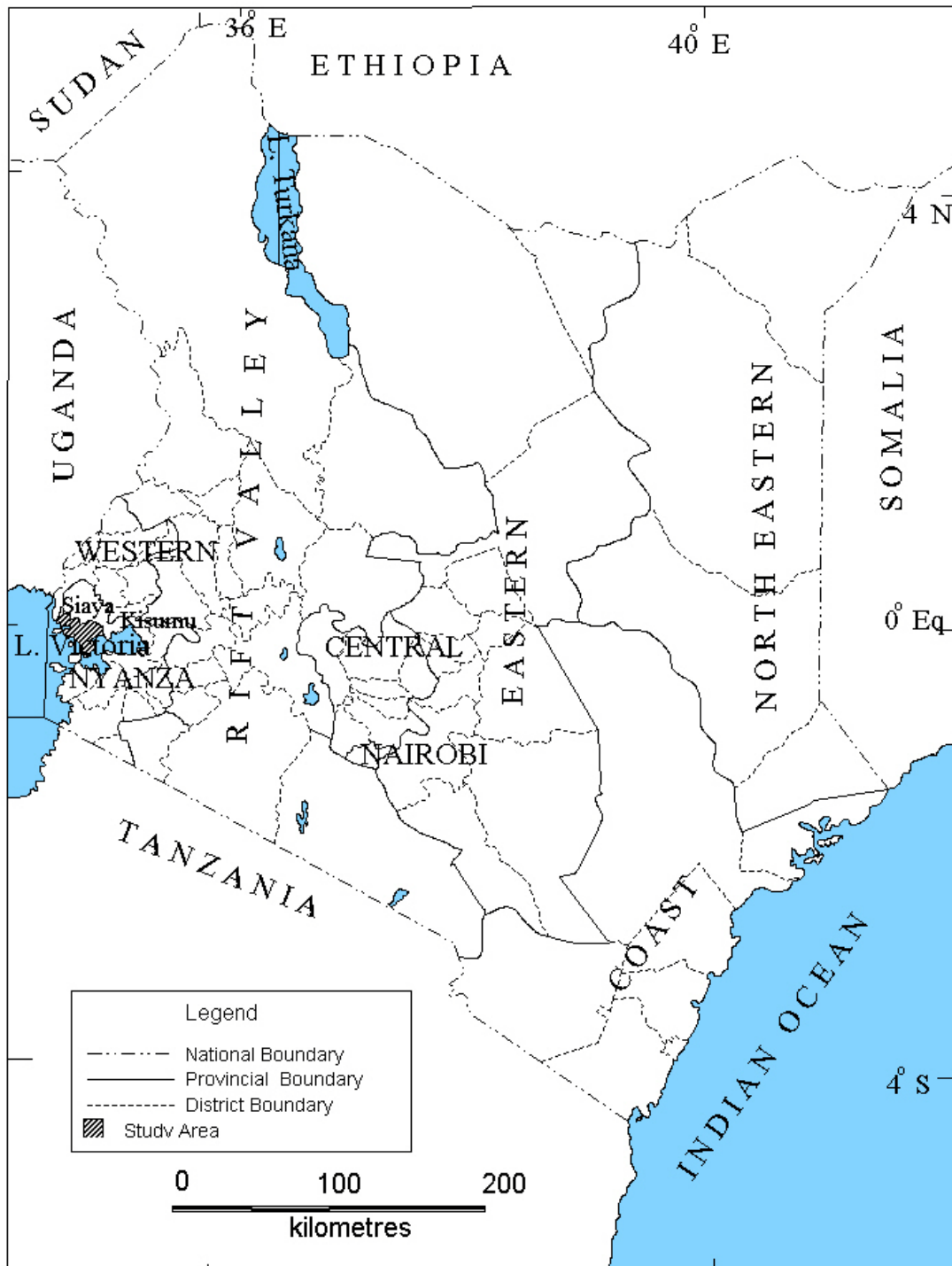
Map 1: Map of Kenya showing Study Area and Lake Victoria Region.