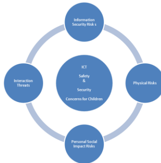
Figure 1: ICT Safety and Security Risks for Children

The next elaboration involves inserting these risks (as shown in Figure 1) into the Life Orientation Program that is currently taught at Primary School Level. It is contended that the children need to be made of aware these risks at a younger age to counteract these negative aspects of using computers and mobile phones. According to Berson and Berson (2004), learning about what it means to be a citizen in a digital world where technology has facilitated global connections is of vital importance as increasing numbers of students go online, they require skills to securely and responsibly take full advantage of computers and the Internet.