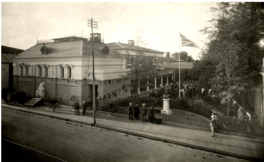
Fig 12: The official opening of extensions and alterations to the Kimberley Public Library and the unveiling of the Bernard Klisser Memorial, September 1927

Of note was the fact that the Library's electric lighting system which was provided for in the recent building contract was completed in conformity with the City Council's regulations.