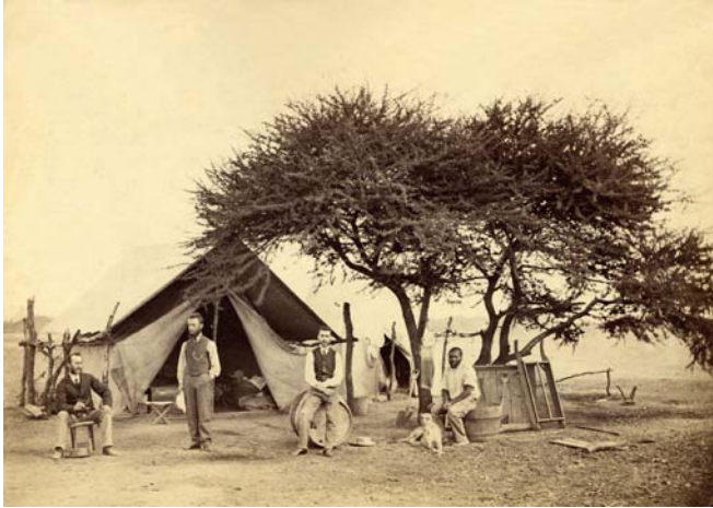
Fig 2: Diggers on the Diamond Fields: c1872

George Beet alludes to the fact that many of the diggers were indeed literate and enjoyed reading their mail and newspapers from 'home' (KAL MS23 Beet).