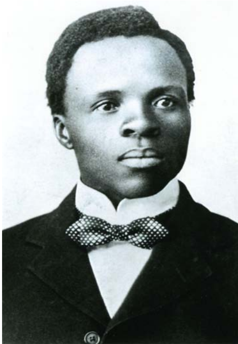
Fig 6: Solomon Tshekisho Plaatje