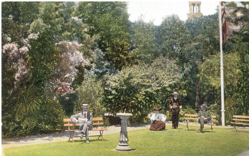
Fig 11: The Public Library garden, c1912