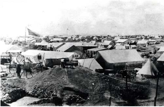
Fig 3 New Rush (Kimberley), 1871