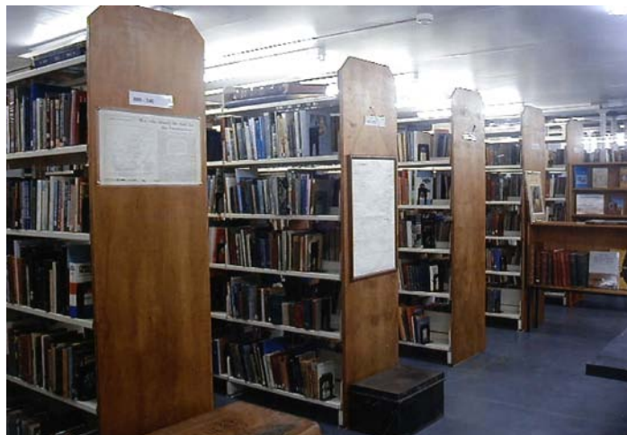
Fig 16: The new strongroom opened in 2004

It was at that time that De Beers came to the rescue as it had done on so many occasions since the inception of the Kimberley Public Library with a munificent offer, which was gratefully accepted, to provide the funds required to construct the required strongroom. These funds were forthcoming from the De Beers Chairman's Fund and the Ernest Oppenheimer Memorial Fund which each donated R250 000 towards the new strongroom (KPL Annual Report, 2004/05).