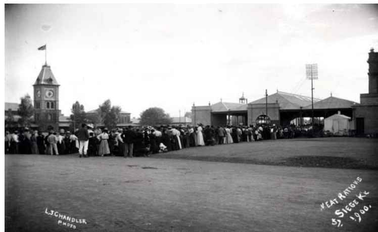
Fig 14: Siege of Kimberley. Queue in the Market Square for meat rations, 1900