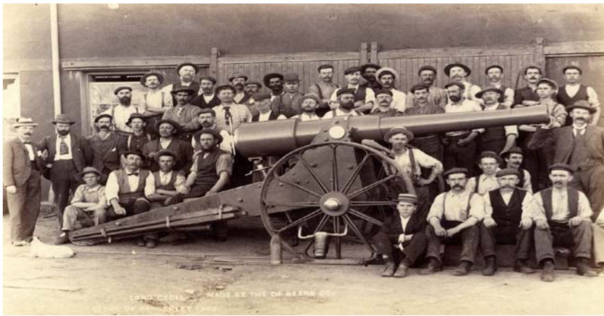
Fig 5: 'Long Cecil' manufactured in the De Beers Workshops, 1900

having contributed substantially, in cash and in kind, to the cost of the war as a whole. Some idea of De Beers' contribution to the British war effort can be gleaned from the Company's War Account for the financial year 1903. This reflects an amount of £75 477.16.3 which was claimed by De Beers from the Imperial Government in respect of expenditure incurred in connection with the Siege. Of this amount the Company was compensated to the extent of £30 000 only. The total losses incurred by the Company in connection with the war as a whole amounted to £272 904.1.2. However, it is recorded that these payments had been made willingly 'for the town, the country and the Empire' (De Beers Annual Report, 1903).