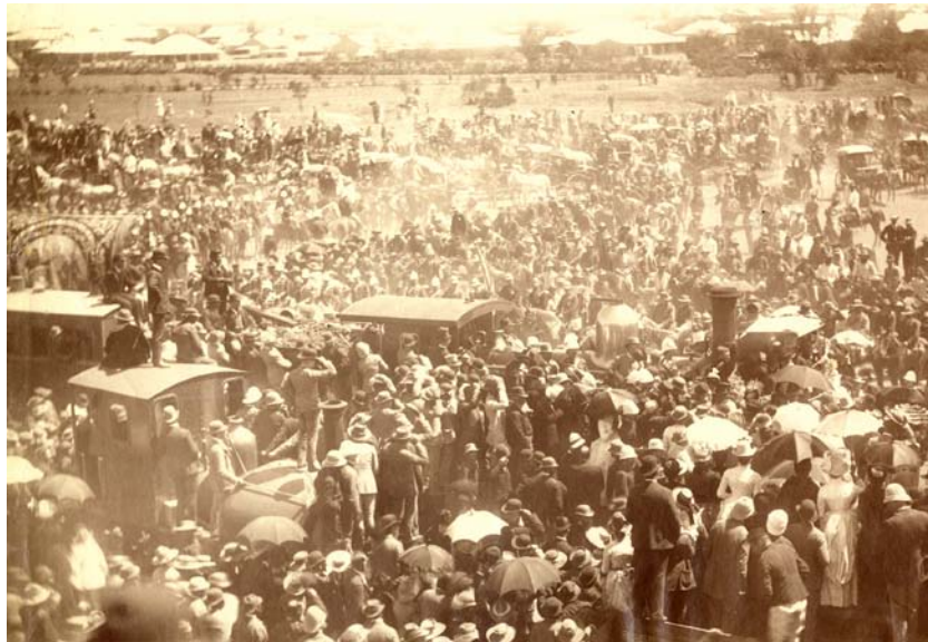
Fig 19: The arrival of the first train in Kimberley from the Cape and Port Elizabeth, 1885

More recent photographs include those donated to the Library by the press and members of the public from time to time.