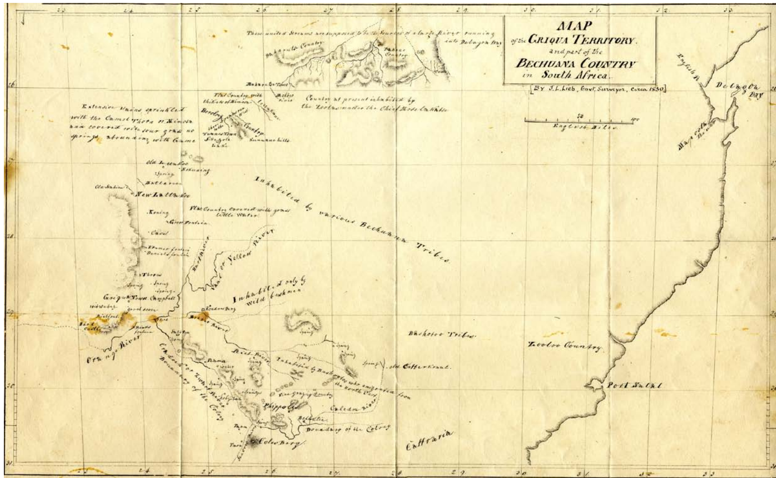
Fig. 1: JL Lieb: A map of the Griqua territory and part of the Bechuana country of South Africa, 1830 (M029)