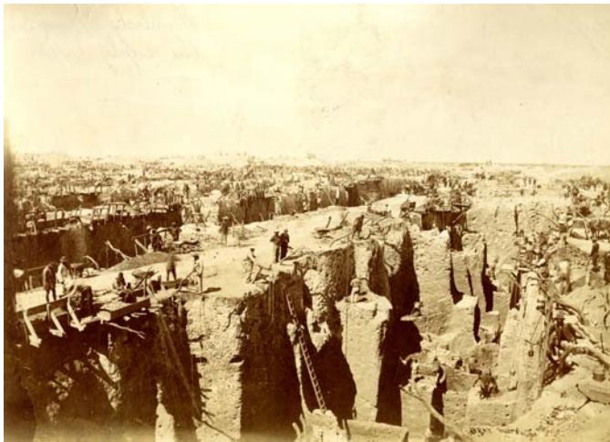
Fig 4 The Kimberley Mine, c1872

Many of those who arrived to dig for diamonds in the early days were mere fortune hunters who had little intention of making Kimberley their permanent home. After the amalgamation of the mines in 1888, a step which heralded greater stability in the diamond industry and symbolised the more permanent nature of the settlement, there were many remarkable men who despite the discovery of gold on the Witwatersrand, did elect to remain in Kimberley and it was they who contributed substantially to the development of the town as well as to its industry and commerce. Many of these men were, in fact, to help shape the destiny of South Africa.