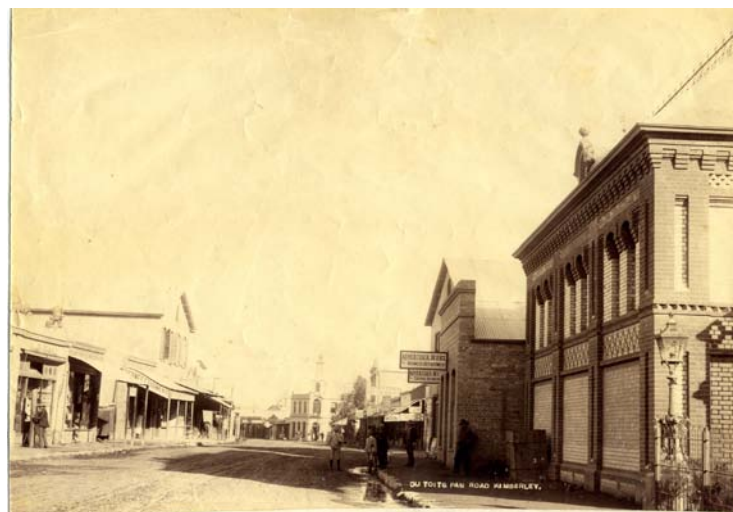
Fig 10: Dutoitspan Road with the new Public Library building in the right foreground, 1888