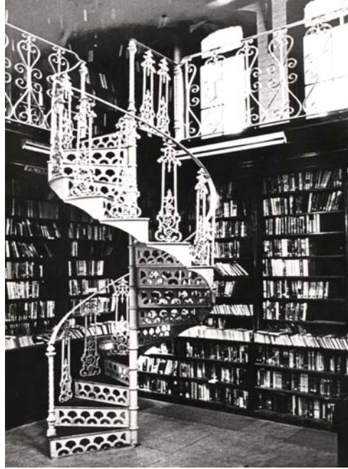
Fig 9: The cast iron spiral staircase and balcony in the main reading room

various colours of facebrick work externally were produced in the Kimberley Public Works Department brickyards (Yuill 1984: 73).