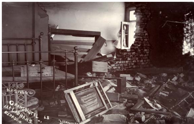
Fig 13: The Siege of Kimberley. The Grand Hotel bedroom in which George Labram of 'Long Cecil' fame was fatally wounded, 1900

be allowed free all privileges of Subscribers except that of borrowing books and that they be allowed to borrow books at half the ordinary rates of subscription (KPL Minutes, 08.03.1900).