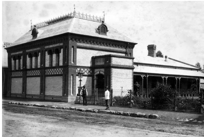
Fig 8: The 'new' Kimberley Public Library building in Dutoitspan Road, 1887

both American and Second Empire style influences and yet, despite this, early photographs showing the Library with its contrasting horizontally banded brickwork suggest that it would not have been totally out of place in a mid-Victorian English industrial landscape (Yuill 1984: 73).