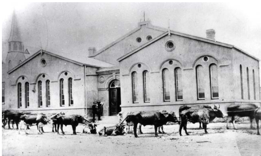
Fig 7: The first building occupied by the Kimberley Public Library in New Main Street, 1882

Having commenced operations in 1882 in a building which they shared with the Municipality and which drastically limited the ability of the Library to serve the public, the Library Committee, with the Hon Mr Justice PM Laurence (See Appendix Laurence: 283) at the helm, set about collecting from the public the necessary funds for the purpose of erecting 'a large and commodious public library' on a site in Dutoitspan acquired previously at an auction for £600 (KPL Minutes, 01.10.1885). £6000 was collected; a remarkable achievement bearing in mind the economic depression prevailing on the Diamond Fields at the time.