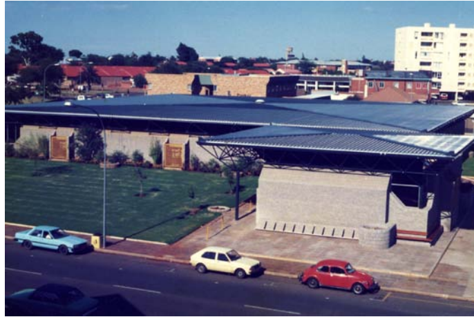
Fig 15: The 'new' Kimberley Public Library opened in 1984

It has long been to the detriment of the Kimberley Africana Library that when the idea of separating the Public Library from its Africana Collection was conceived, insufficient consideration was given to the requirements of a research library as the Africana Library simply became a branch of Kimberley's public library service. This meant that it was generally funded and staffed on a basis similar to that of a public lending library. This oversight has plagued the institution ever since.