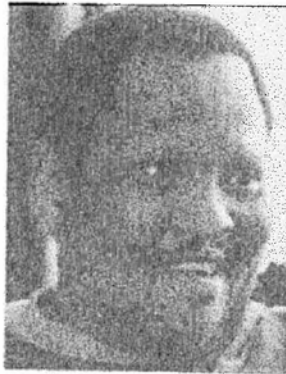
Arnold (just call me Makhenkesi) Stofile, the Eastern Cape premier