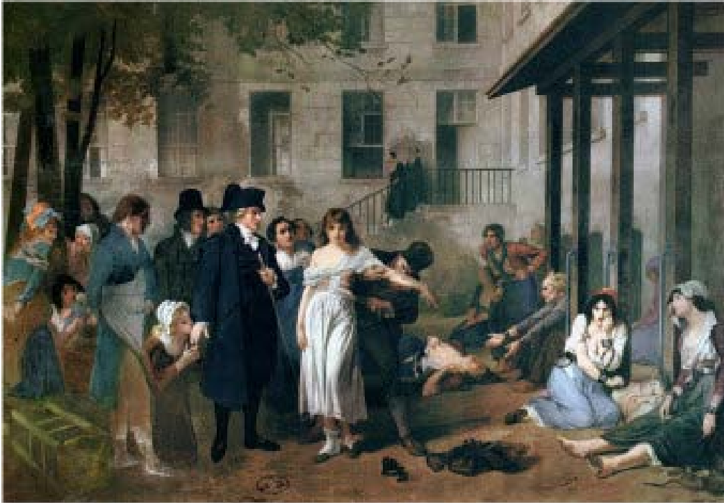
Philippe Pinel is releasing "lunatics" from their chains at the La Salpêtrière Asylum in Paris.