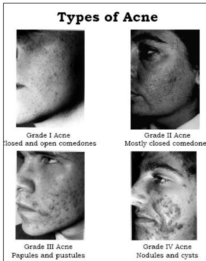
Figure 2.1. Types of acne

According to Fulton (2002:96) dermatologists have classified the phenomenon of acne into different grades. The higher the grade of acne, the more severe the acne and the greater the need for an intervention by a dermatologist.