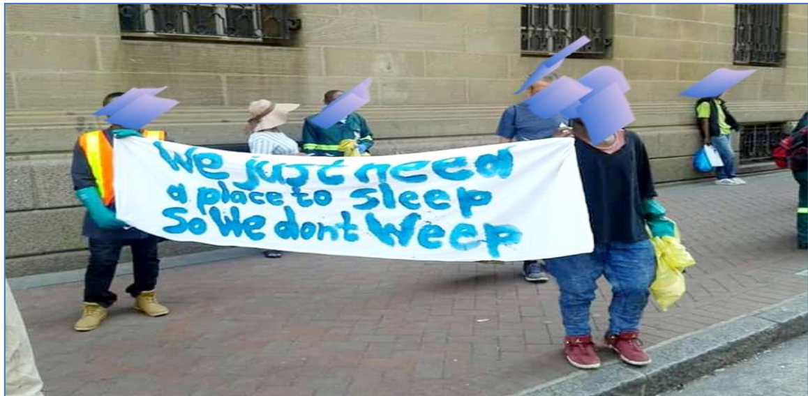
Figure 2.3: 10 October 2018, World Homelessness Day, homeless people, social workers and non-governmental organisations' leaders; clean-up and awareness campaign