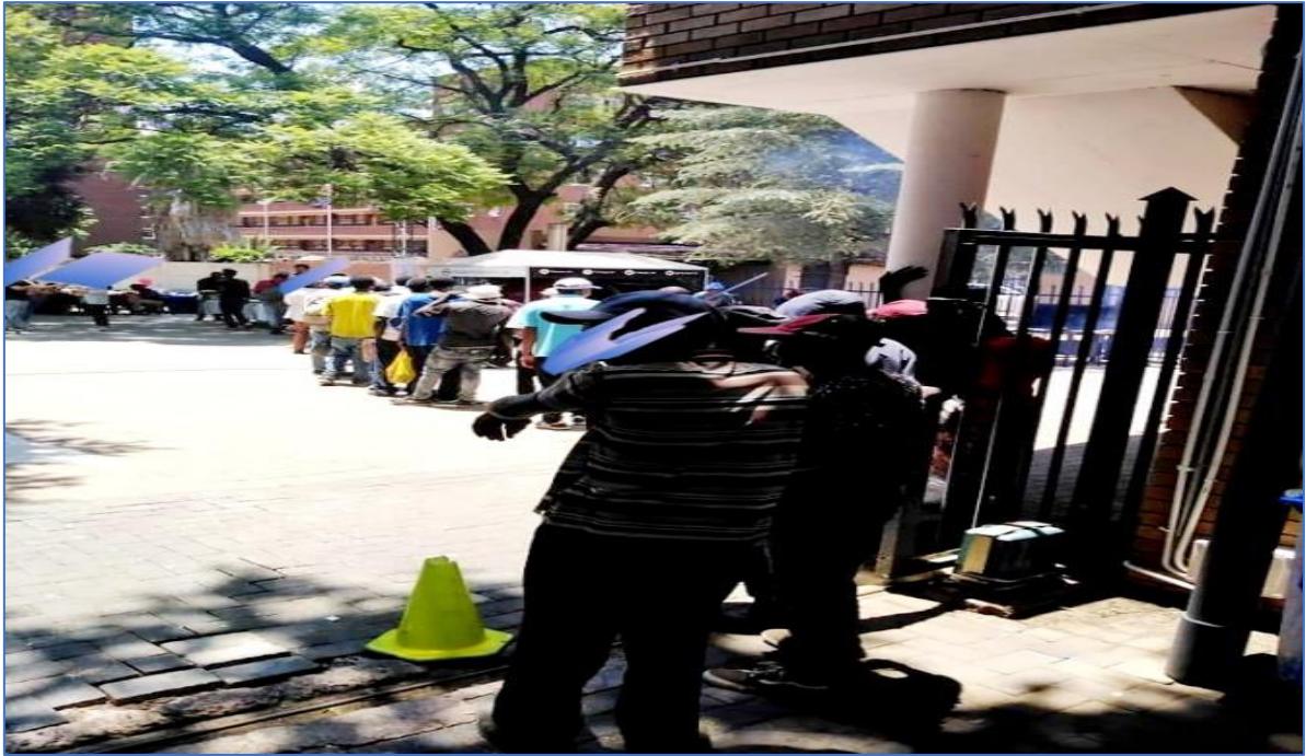
Figure 2.4: Homeless people queuing for food

The figures above depict the contextual challenges encountered by individuals experiencing street homelessness and how they address their situations. The collaborative role of social workers and homeless people in addressing street homelessness is captured in Figure 2.3 and 2.4, where homeless people embarked on a clean-up campaign and march along with social workers and other NGOs' leaders to commemorate World Homelessness Day. In Figure 2.2, during the march from Tshwane, Church Square to Union Buildings; the marchers chanted "treat as like you treat yourself" raising the concern of equality and fairness.