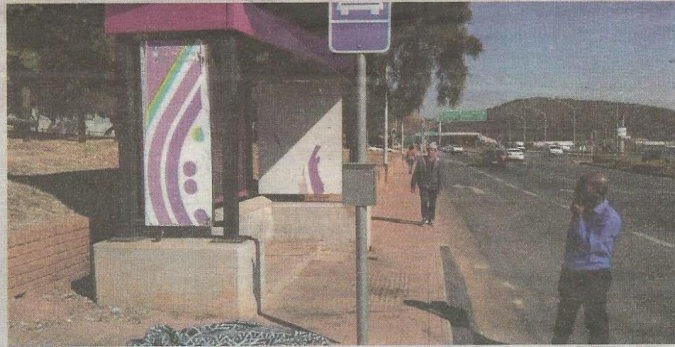
Scene where the fifth body was found.