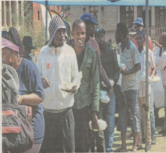
The homeless commemorate World Homeless Day and the five homeless men killed in Pretoria earlier this year.

PRETORIA CENTRAL REKORD OCTOBER 18, 2019