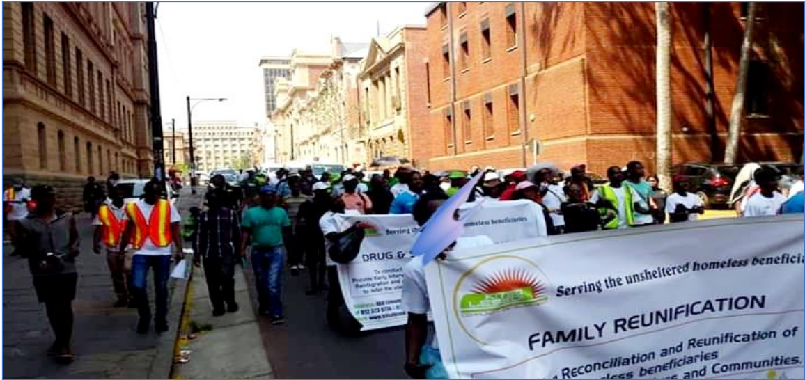
Figure 2.2: 10 October 2019 World homelessness Day march by homeless people, social workers and non-governmental organisations' leaders; Pretoria central