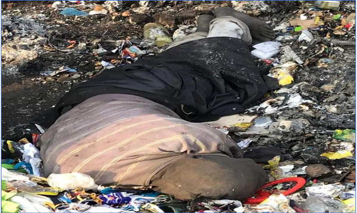
Figure 2.1: A homeless person sleeping rough, Marabastad

or political gatherings. Concerning the physical context of homelessness, the participants in the study reside within the CoT, particularly in the city centre or business establishment and bushes, taxi ranks, bus or train stations close to the city centre, as illustrated in Figure 2.1 below: