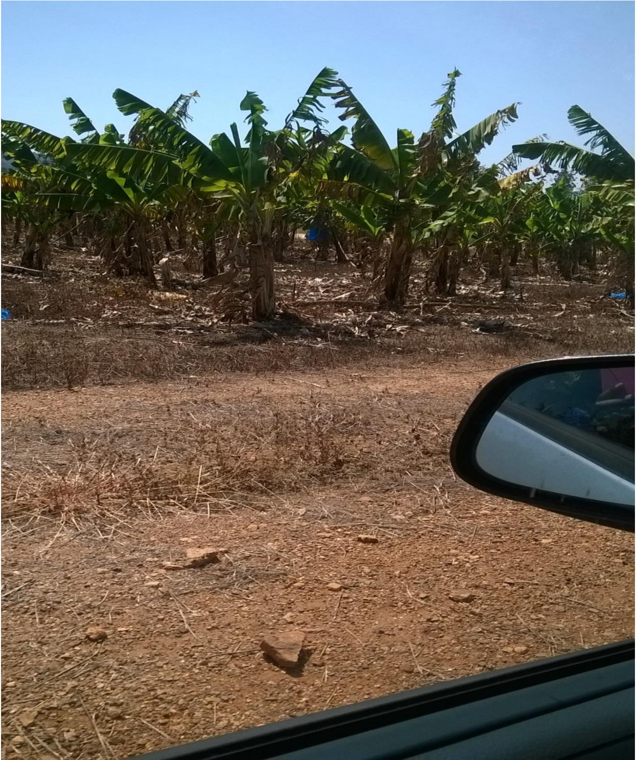
Figure 4.2: Banana plantation (Photographed with permission)