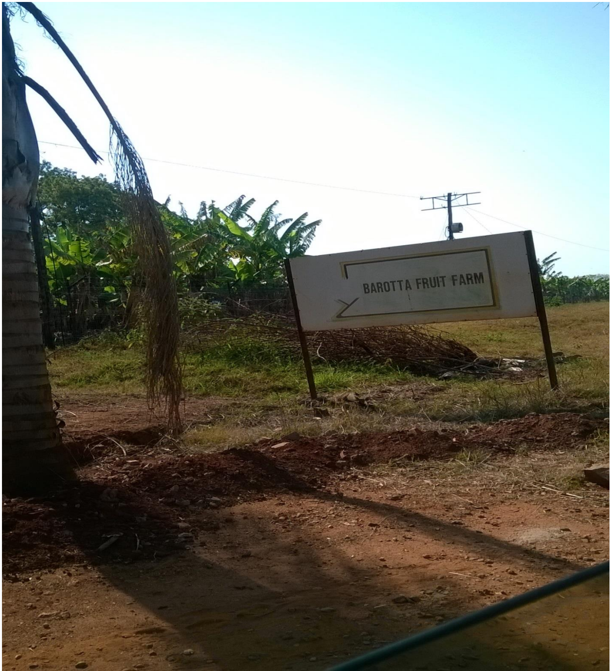
Figure 4.3: Farm signage (Photographed with permission of farm manager)