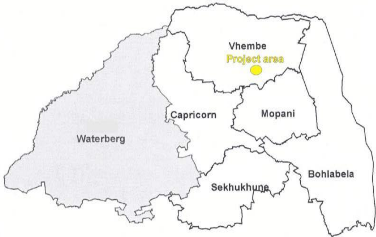
Figure 3.1: Map of Vhembe District Municipality (google.com)