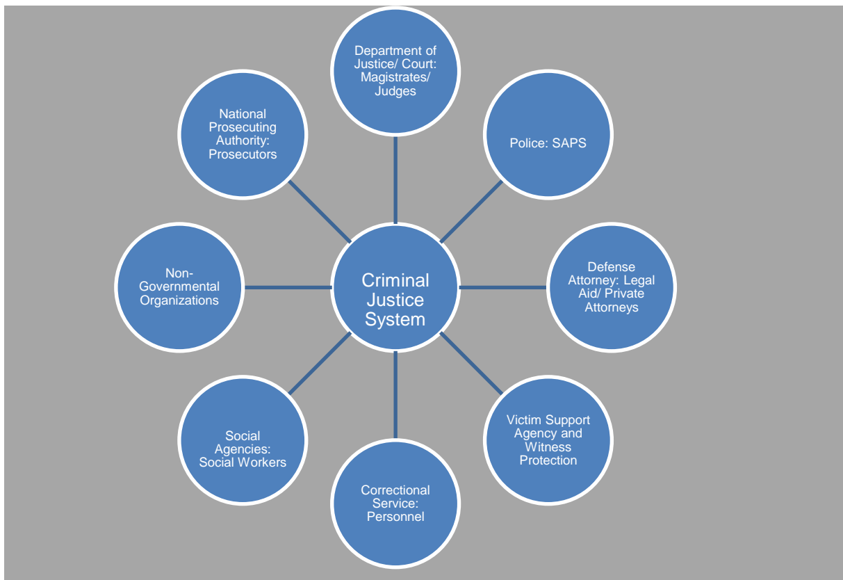
Diagram: 1. Role-players in Criminal Justice System

Davies et al. (2010:7) regard neighbourhood watches and private security guards as part of criminal justice, which may be a surprise to those who think that the criminal justice system consists of court staff. Davies et al. (2010:4) mention a number of agencies that are involved in criminal justice namely the police, prosecutors, criminal defence services, courts, ministry of justice probation, prisons and youth justice.