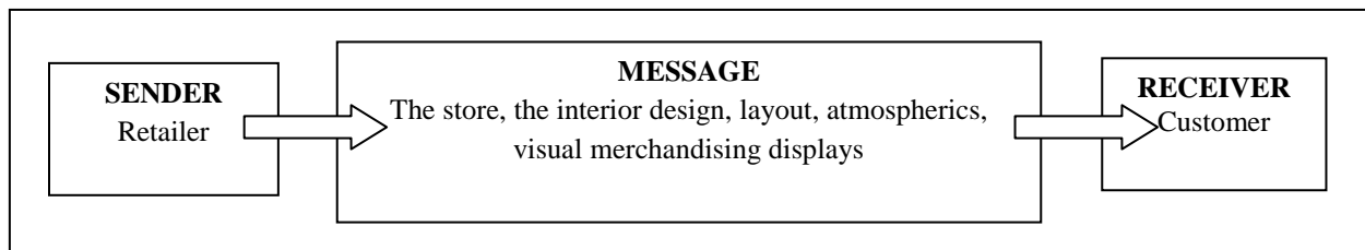
Figure 2: Visual Merchandising Communication Process

Visual merchandising displays use creative techniques in order to save both the sales person's and the shopper's time by making shopping effortless. The visual merchandising display process is often referred to as the "silent sales person" by providing the consumers with information through visual mediums, as well as by suggestive selling - suggestions to add items to a consumer's original purchase (Bhalla & Anuraag, 2010: 21). This process is often referred to as the visual merchandising communication process. A great deal of communication between the retailer and the consumer takes place through the use of visual merchandising displays. The retailer communicates to the consumer by means of their store, the store's interior design, layout, atmospherics and merchandising displays, as shown in Figure 2.