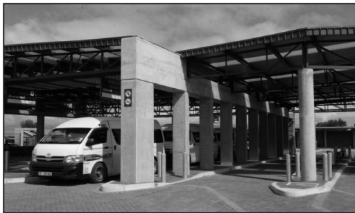
Figure 4: Cape Town's "green" taxi rank