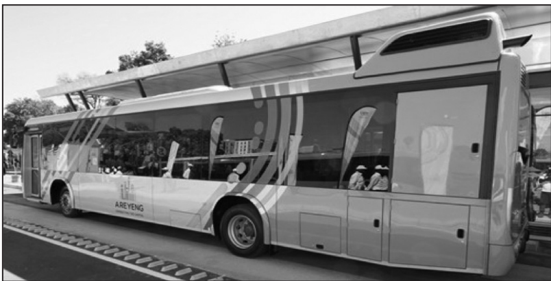
Figure 2: A Re Yeng TRT bus in Tshwane