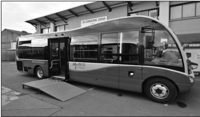
Figure 3: MyCiTi BRT bus in Cape Town