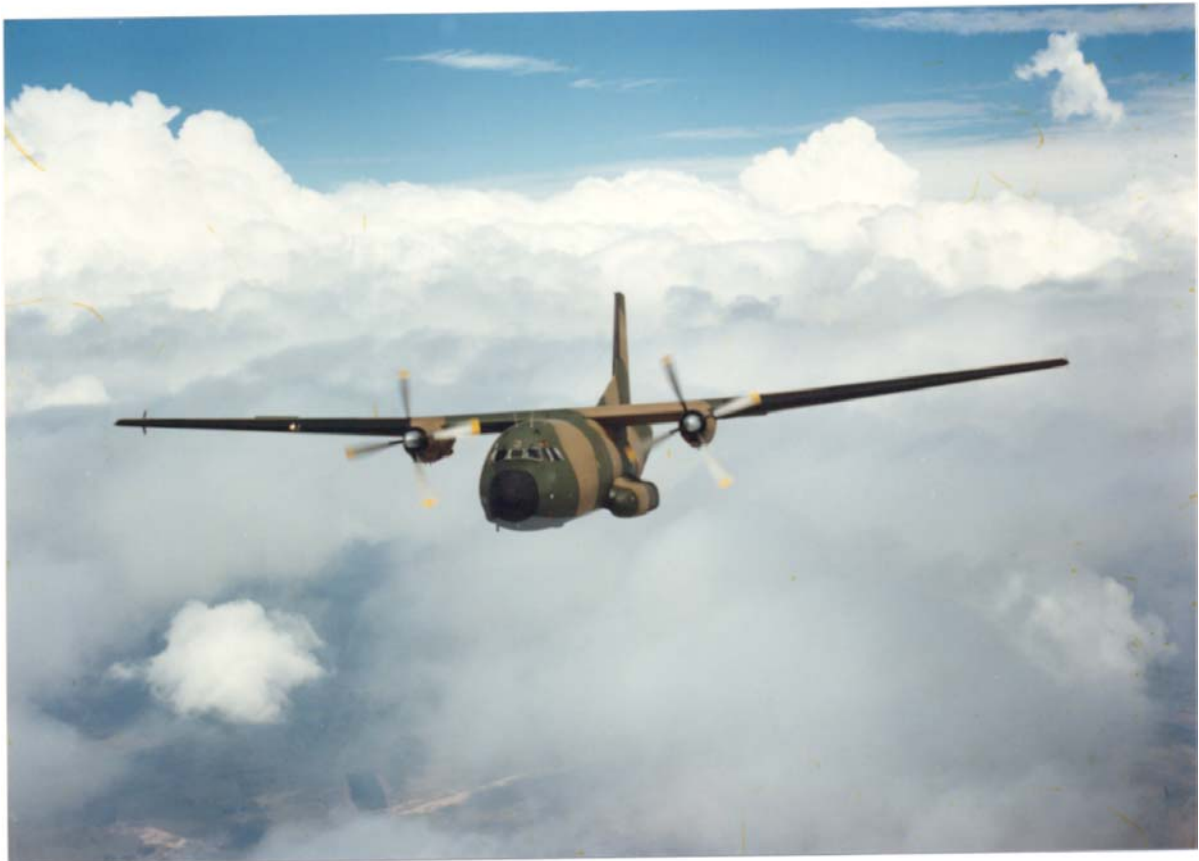
C130B Hercules (above) and C-160Z Transall (below)