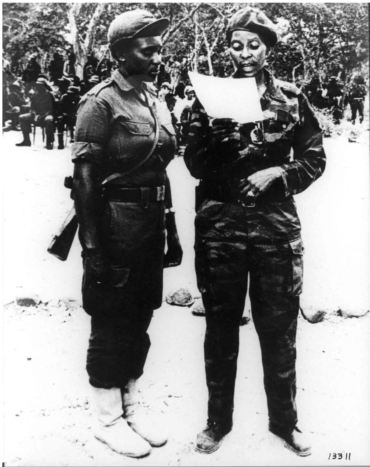
Two SWAPO women fighters at a PLAN parade in Cassinga.