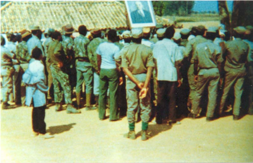
Group of SWAPO members, almost all males, gathered around a picture of Lenin. Most are wearing uniform, some in camouflaged fatigues but the majority in olive drab, with only a few in civilian dress.