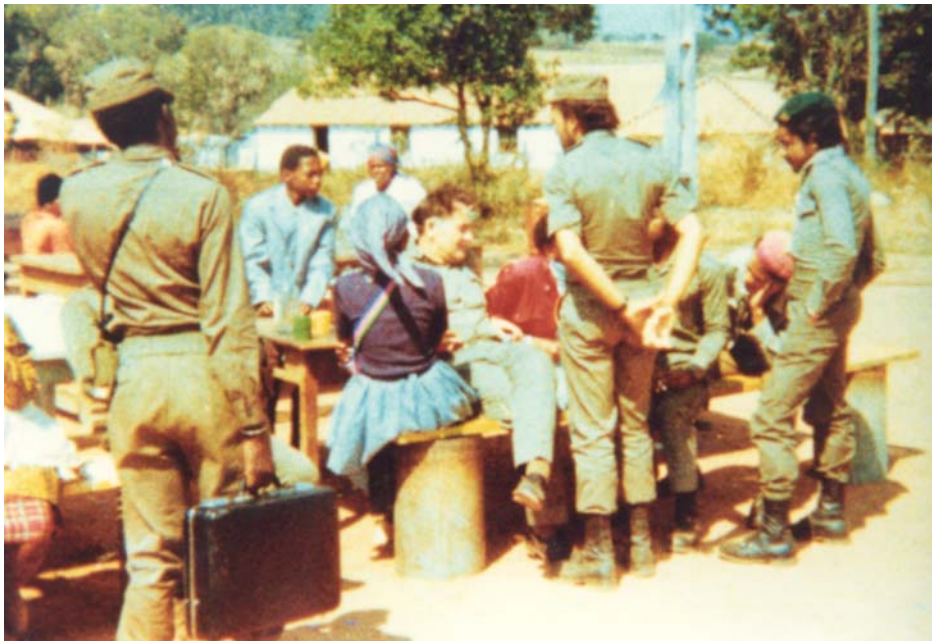
Black, white and mulatto soldiers (allegedly Soviet and/or Cuban instructors or advisors) in conversation with SWAPO civilians, mostly women. According to SWAPO they were refugees, while according to the SADF they were camp prostitutes.