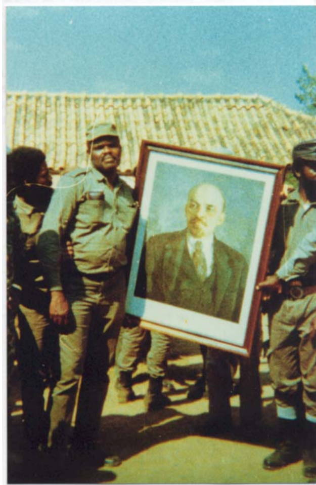
SWAPO guerrillas, in uniform, holding a framed picture of Vladimir Lenin.