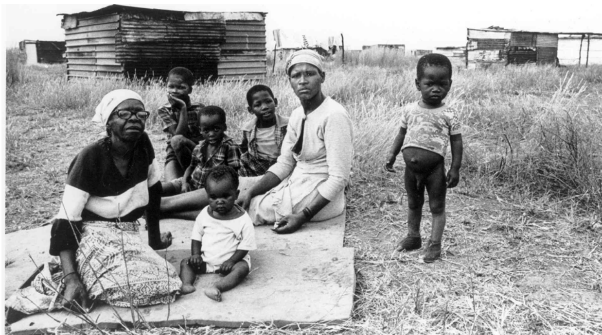
Refugees outside a shack. Although it is claimed that the photograph was taken at Cassinga prior to the raid, the aerial photographs do not show structures of this nature and the absence of any trees or bushes in the vicinity makes the claim dubious.