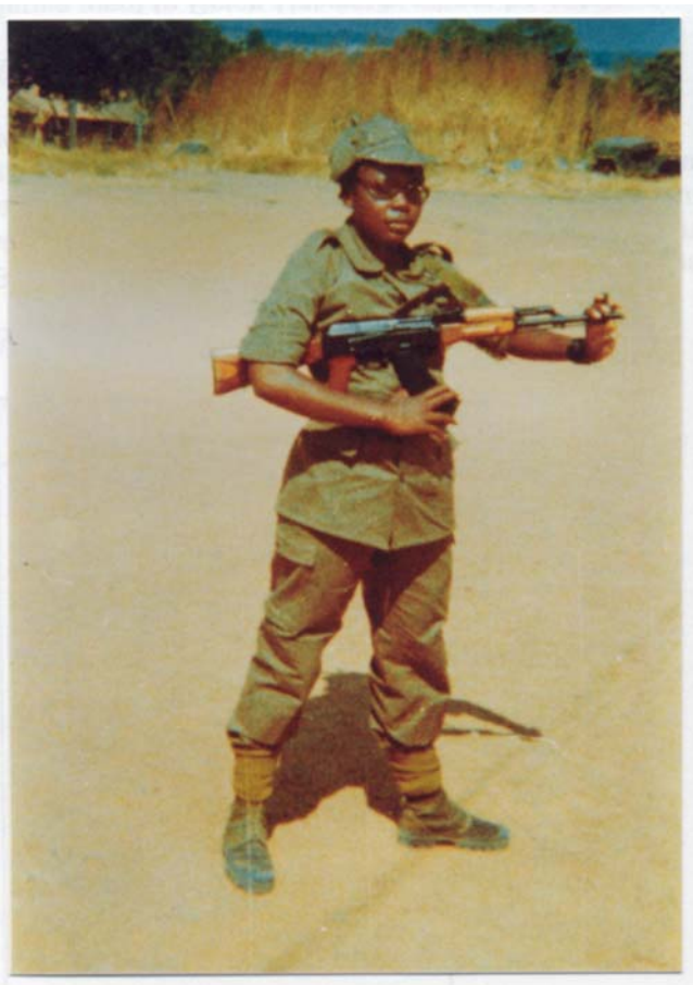
Woman PLAN guerrilla, in uniform and armed with an AK-47 assault rifle.

1. Photographs provided by a paratrooper who declined to be named but who claimed that these photographs were developed by South African Military Intelligence from a film found at Cassinga during the raid. He acquired copies when they were printed.