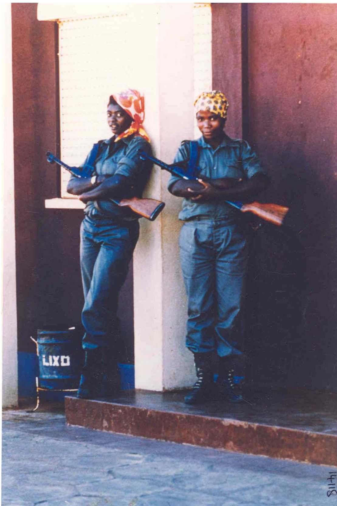
SWAPO women fighters of PLAN. Though they are wearing uniform, it could also be construed as civilian dress because of its blue colour. There is no doubt about the sub-machine guns, however.